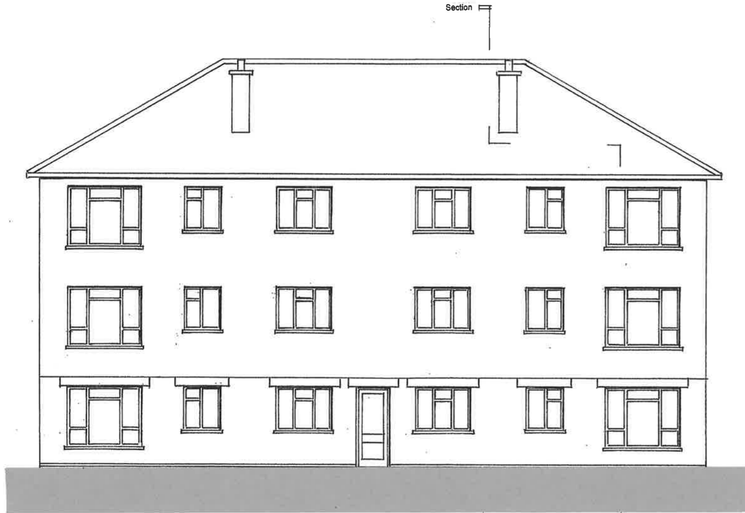
EXISTING WEST (REAR) ELEVATION