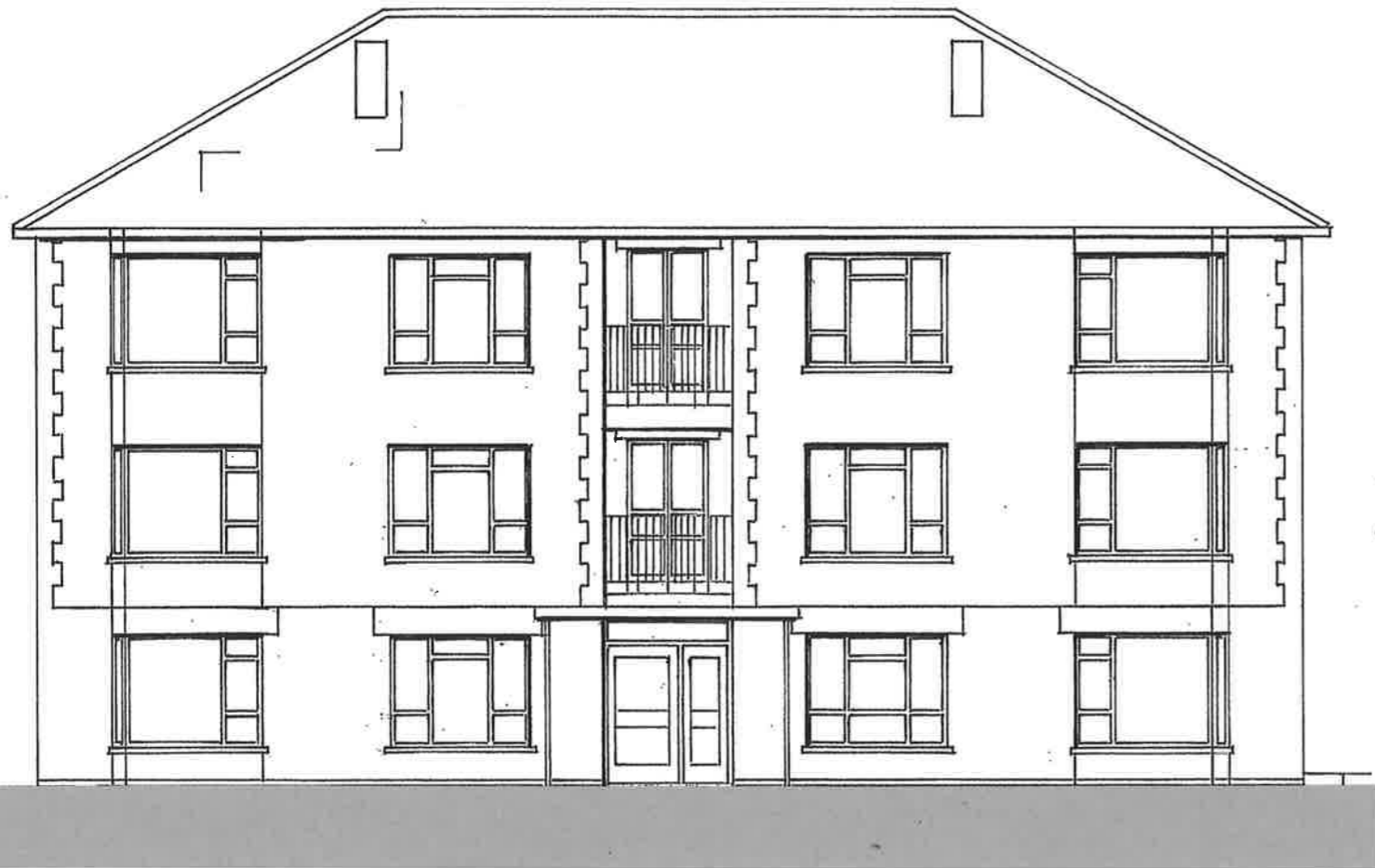
EXISTING EAST (FRONT) ELEVATION