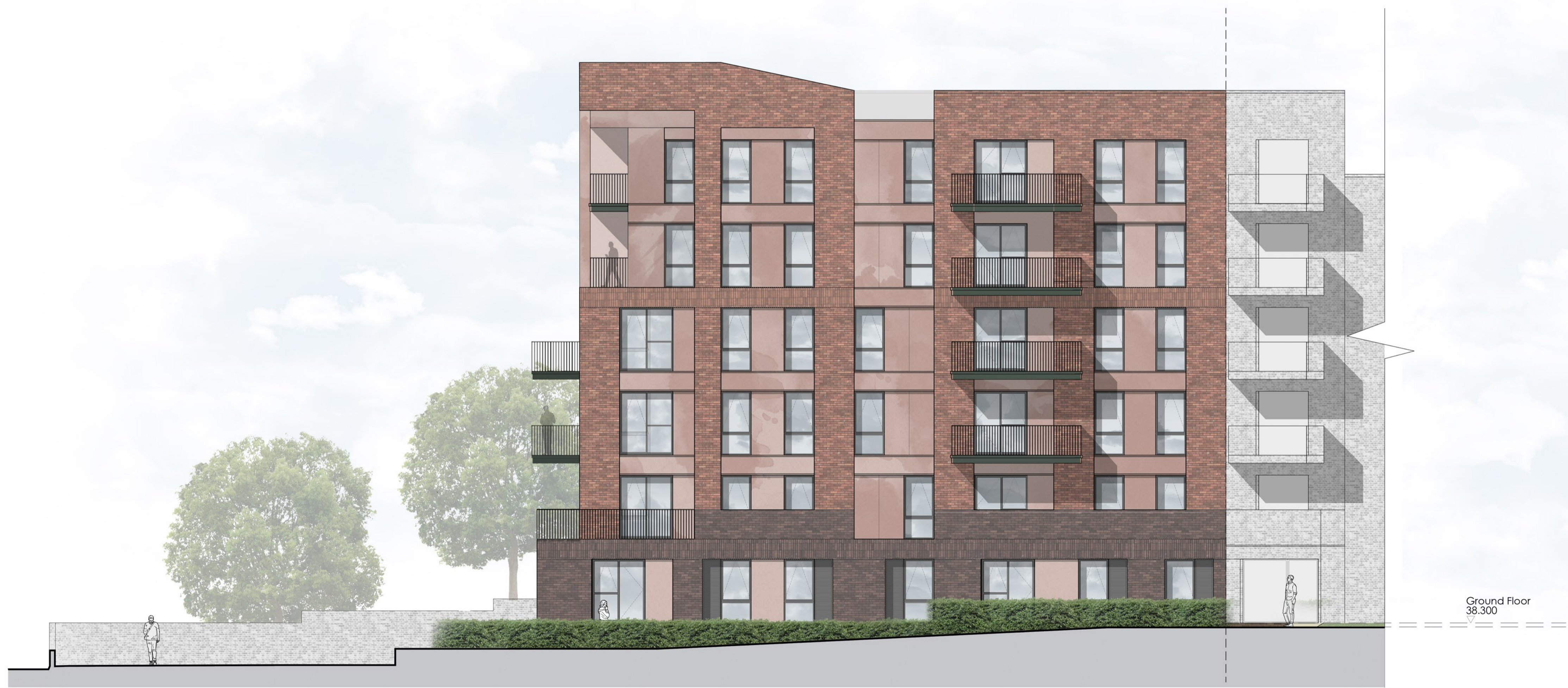
2 East Elevation B Scale: 1:100

dashed line denotes change in angle of facade/footprint