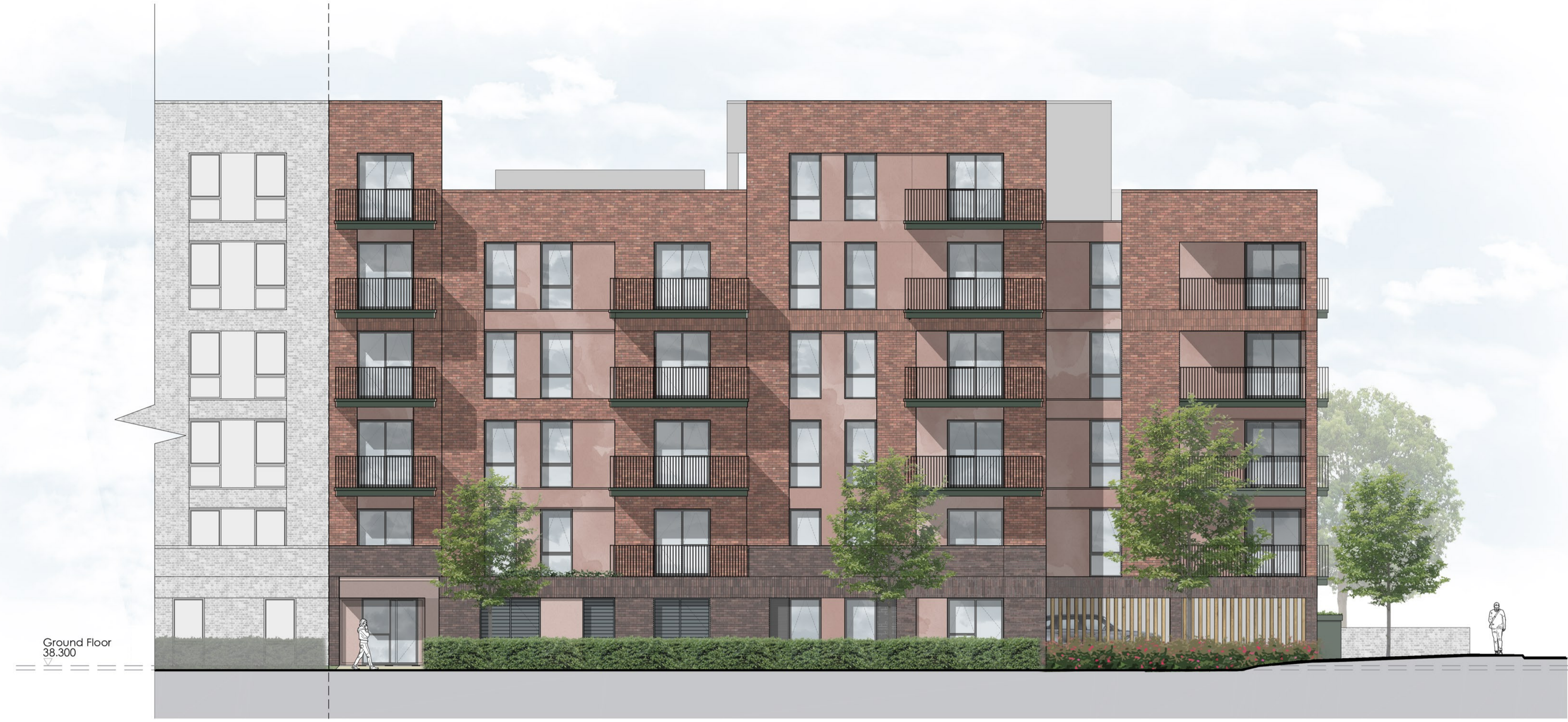
1 East Elevation A Scale: 1:100

dashed line denotes change in angle of facade/footprint