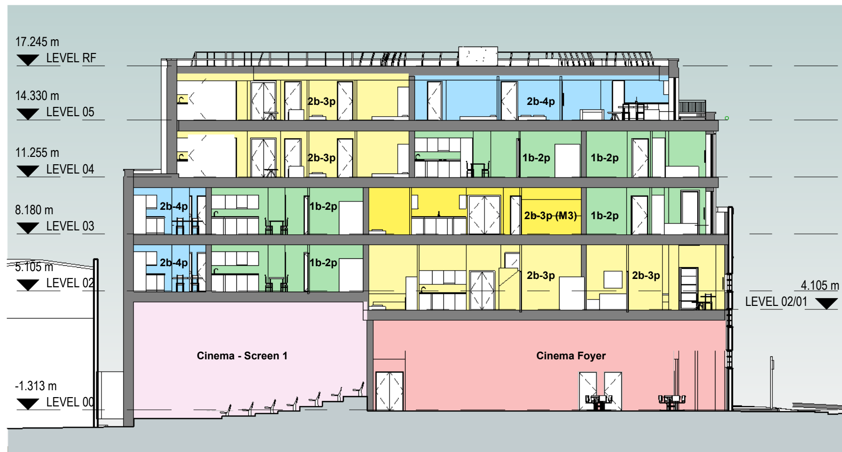
Section 02 1 : 200