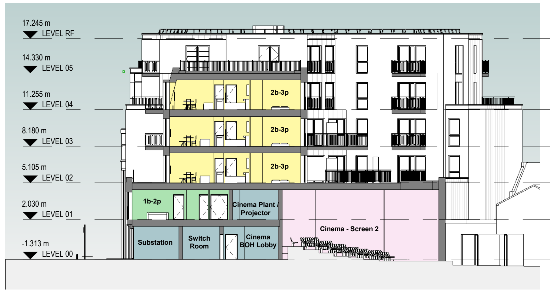
Section 03 1 : 200