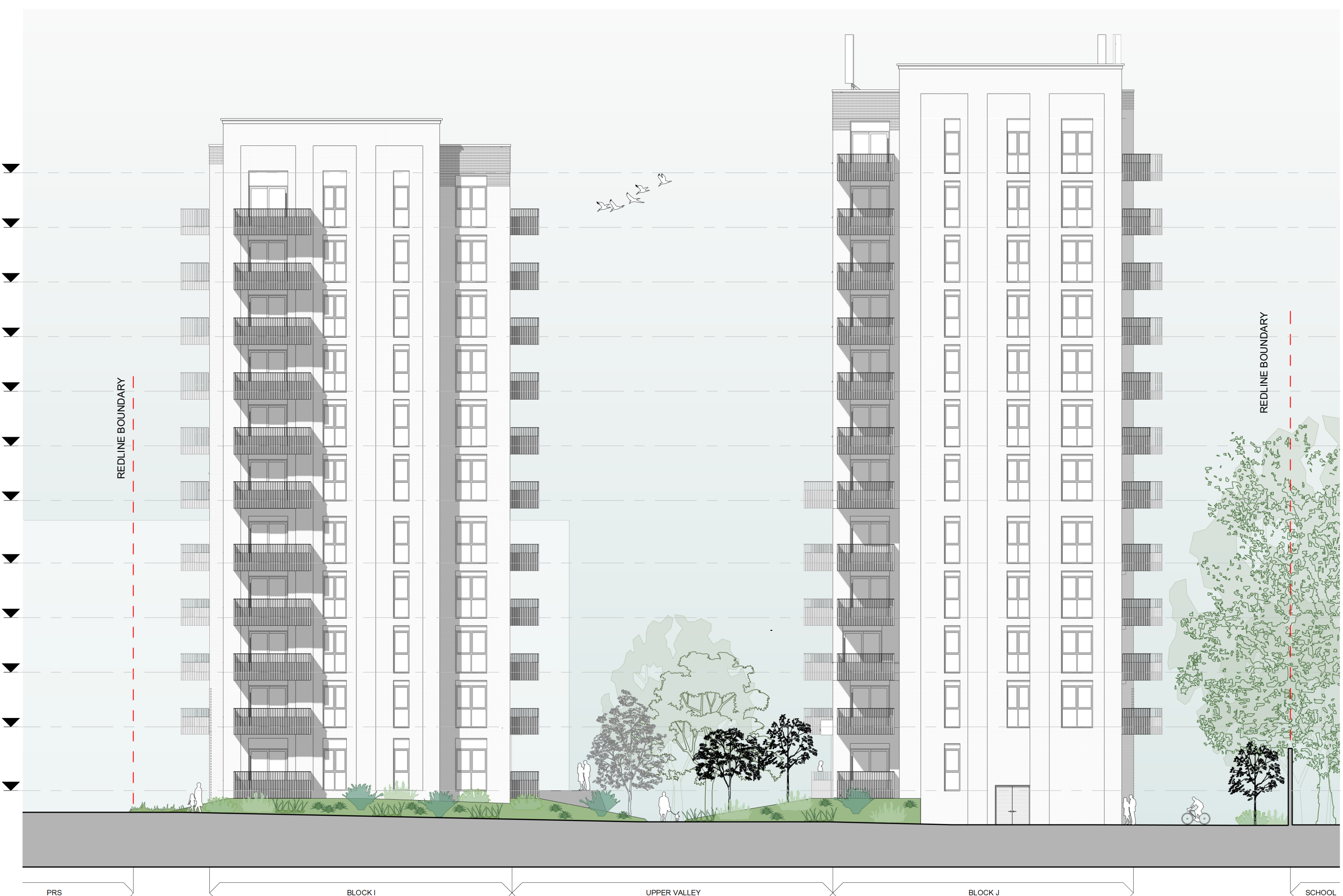
DD - Block I/J South Elevation