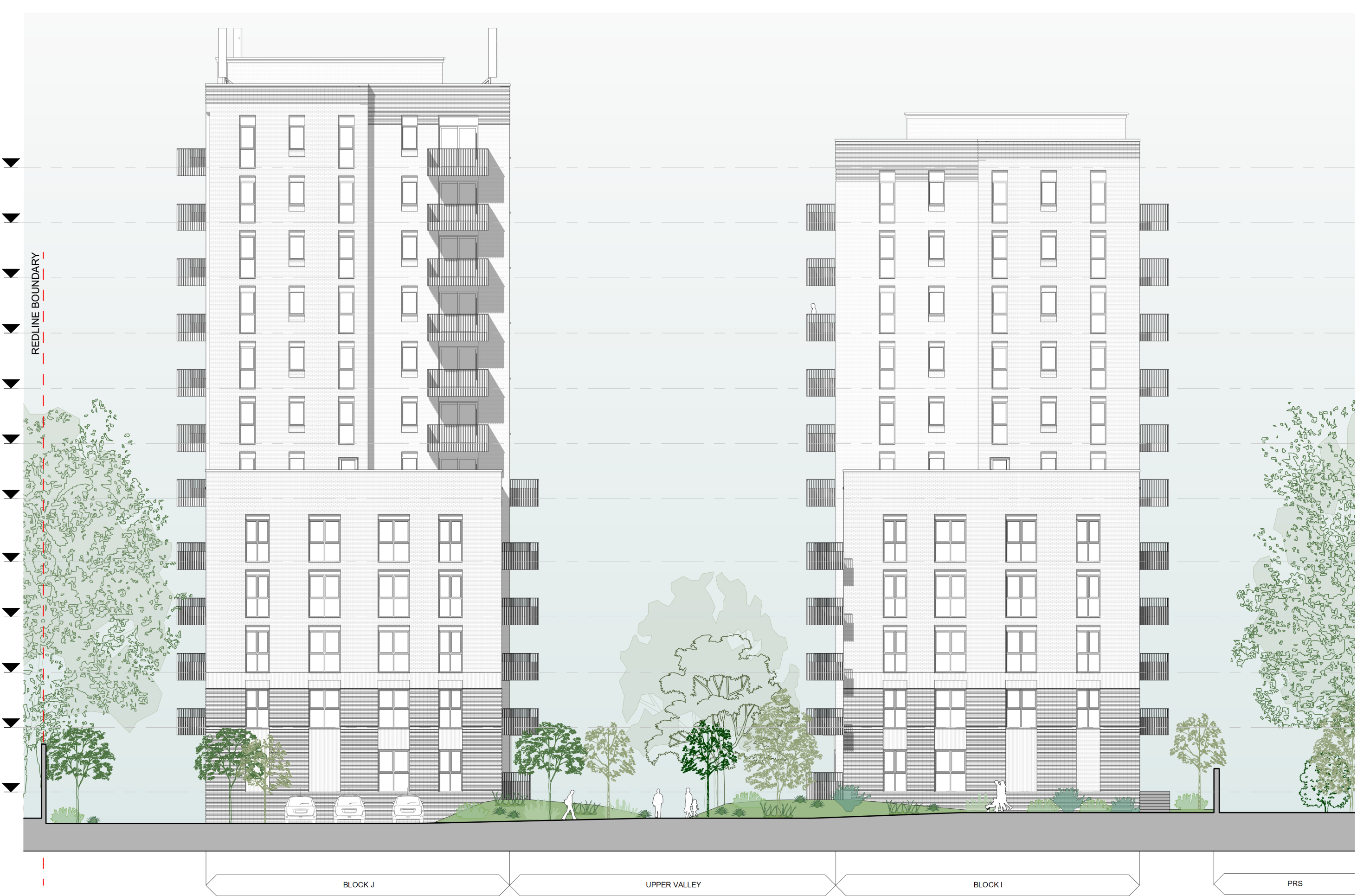
BB - Block I/J North Elevation