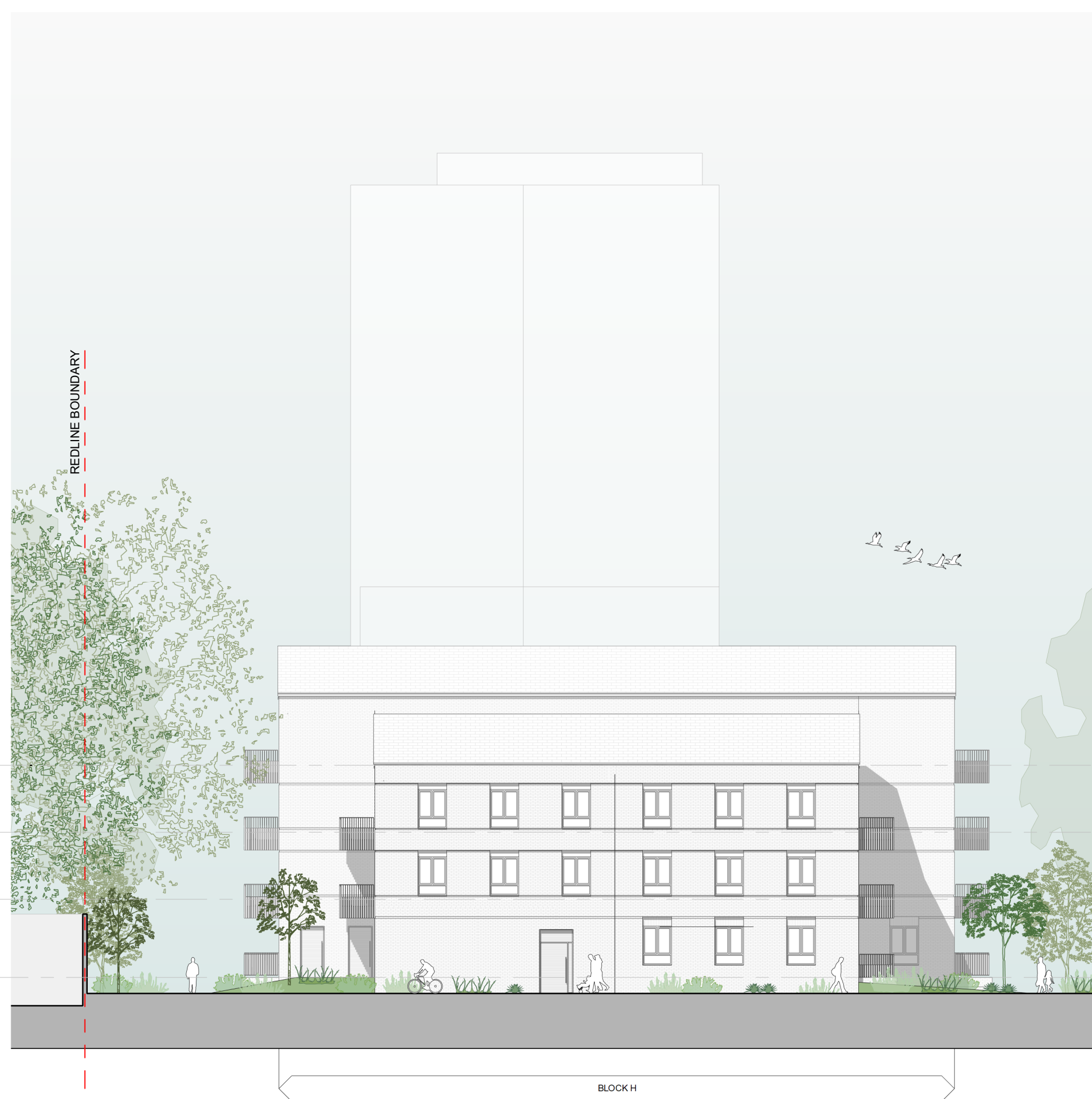
CC - Block H North Elevation