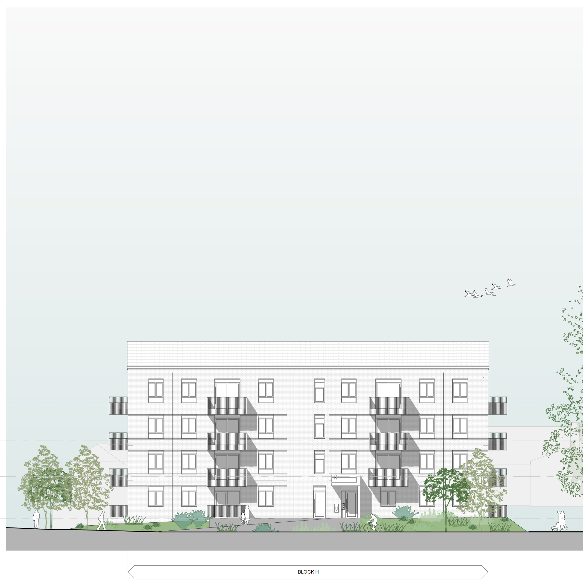
AA - Block H South Elevation