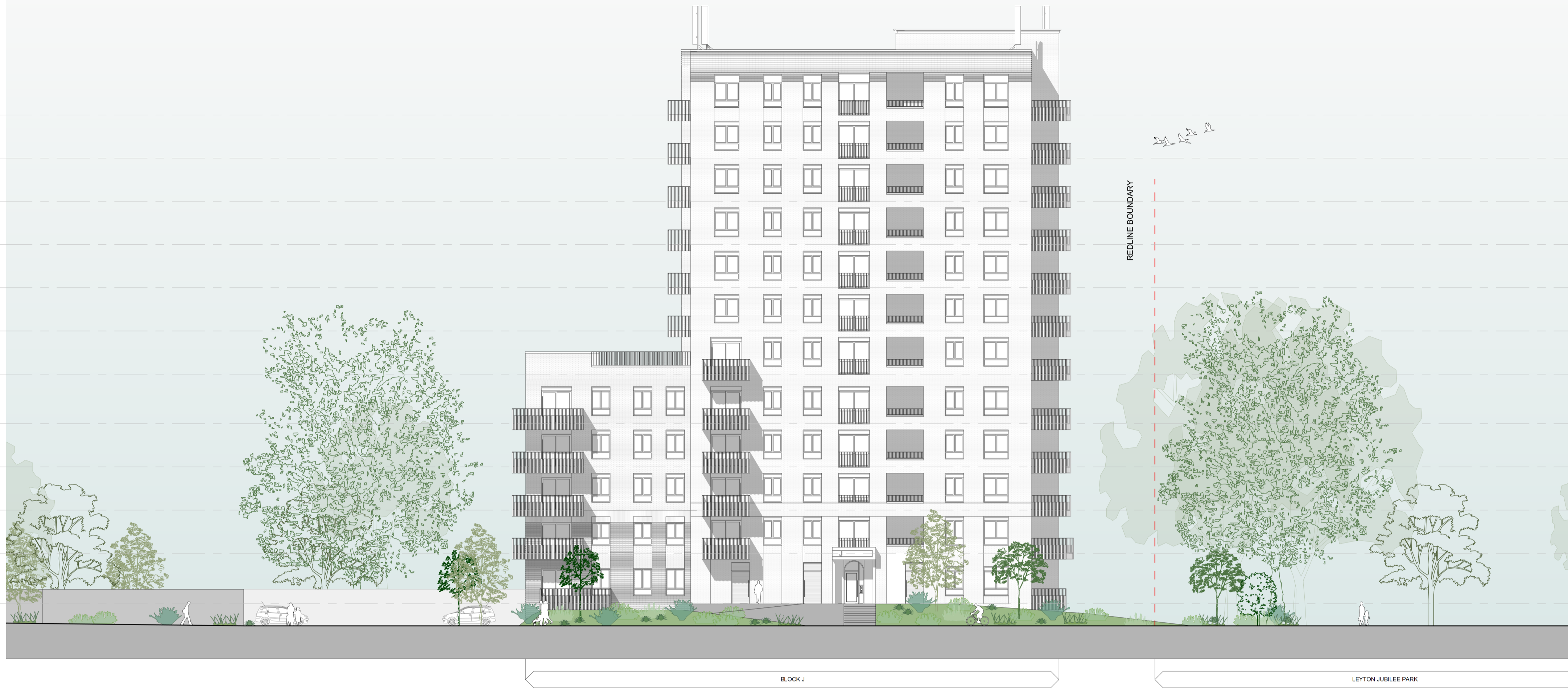
AA - Block J West Elevation

Level 11 42925 ▼ Level 10 39775 ▼ Level 9 36625 ▼ Level 8 33475 ▼ Level 7 30325 ▼ Level 6 27175 ▼ Level 5 24025 ▼ Level 4 20425 ▼ Level 3 17275 ▼ Level 2 14125 ▼ Level 1 10975 ▼ Level 0 7300 ▼