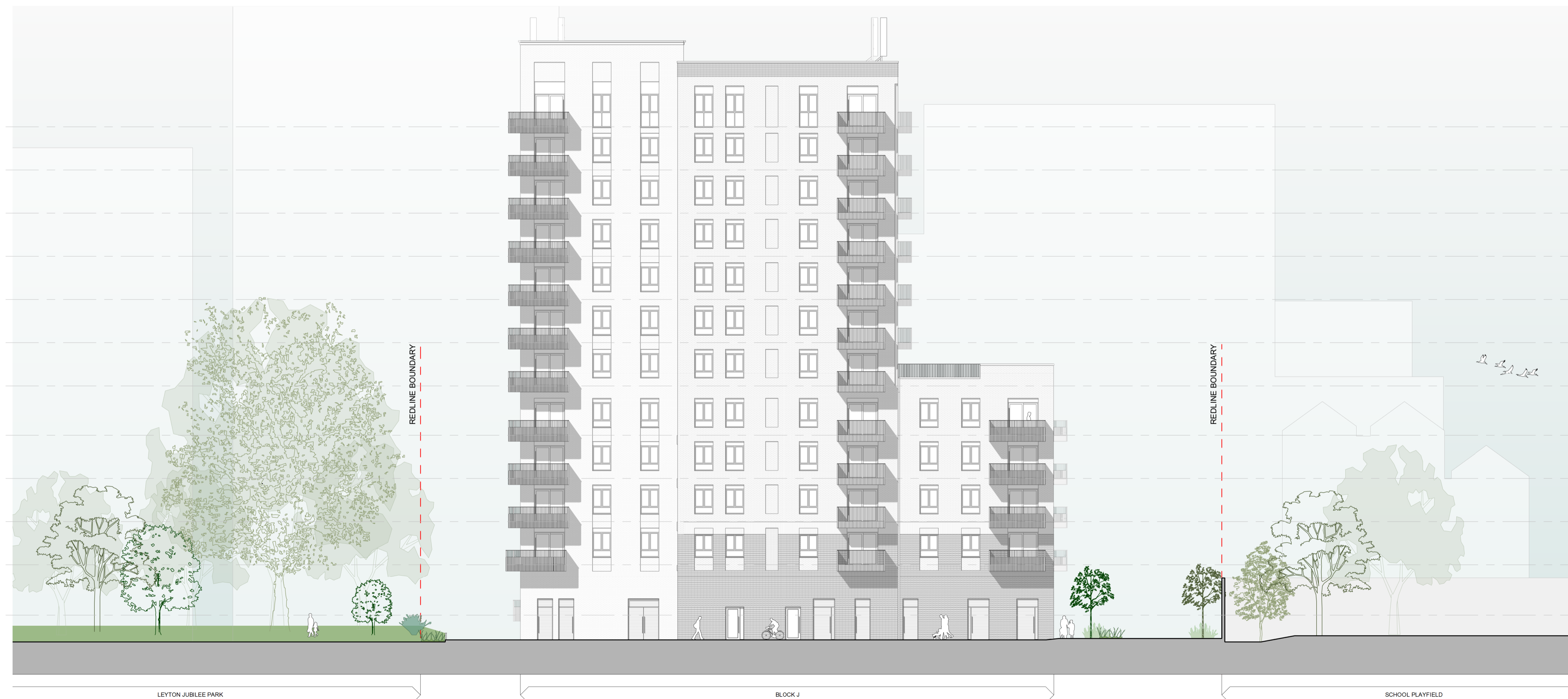
BB - Block J East Elevation

Level 11 42925 ▼ Level 10 39775 ▼ Level 9 36625 ▼ Level 8 33475 ▼ Level 7 30325 ▼ Level 6 27175 ▼ Level 5 24025 ▼ Level 4 20425 ▼ Level 3 17275 ▼ Level 2 14125 ▼ Level 1 10975 ▼ Level 0 7300 ▼