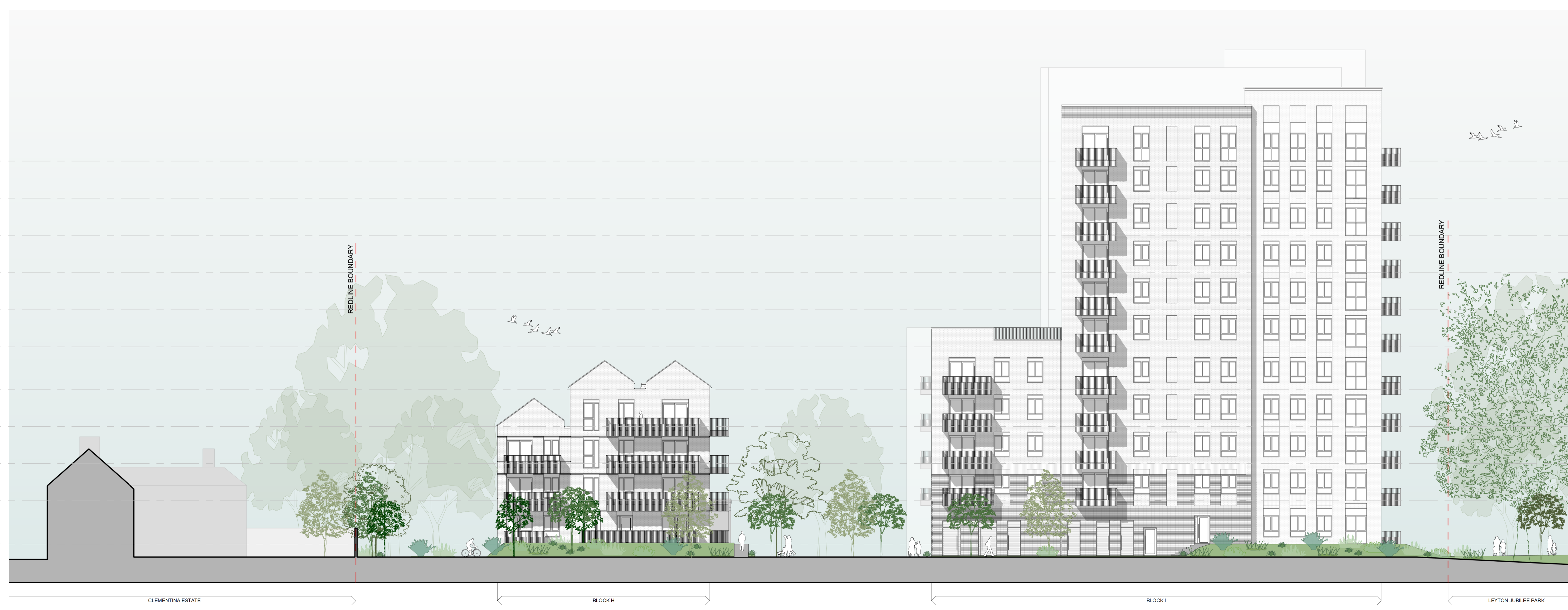
BB - Block H/I West Elevation