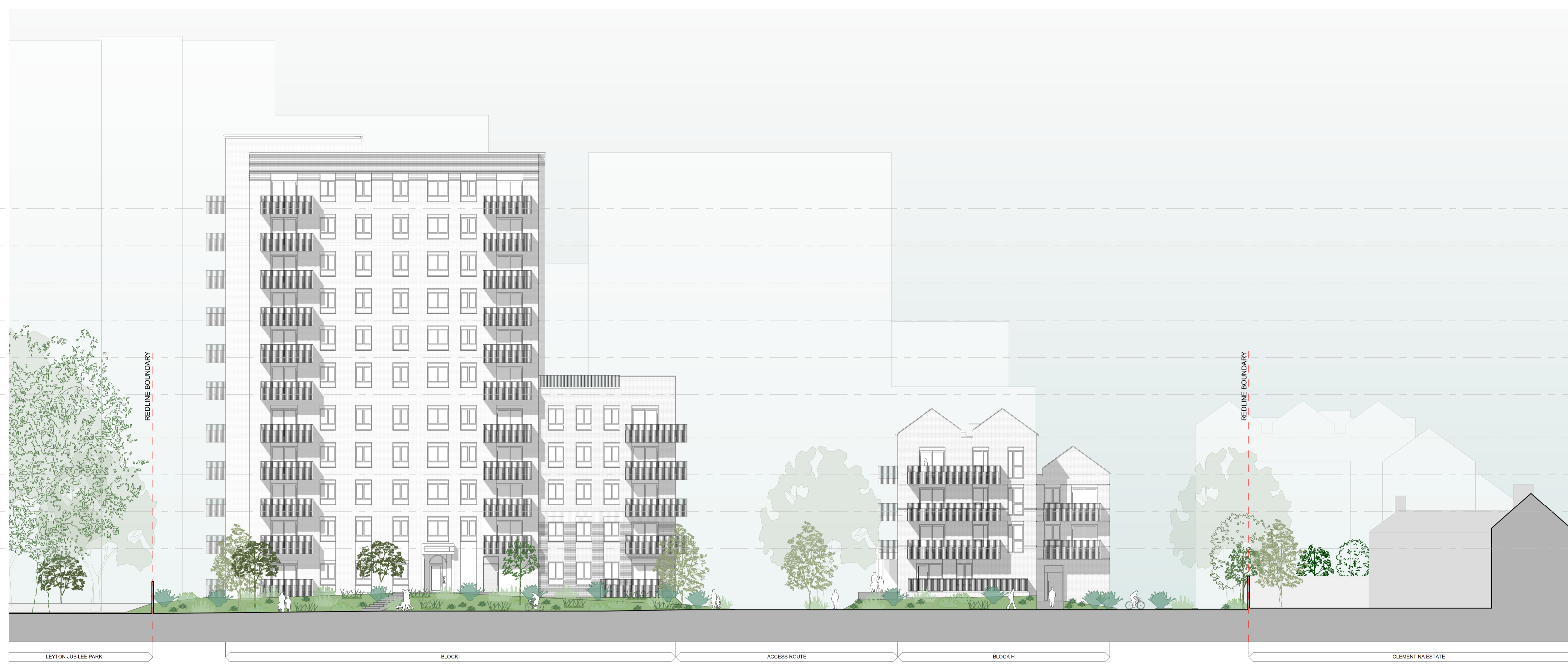
AA - Block H/I East Elevation