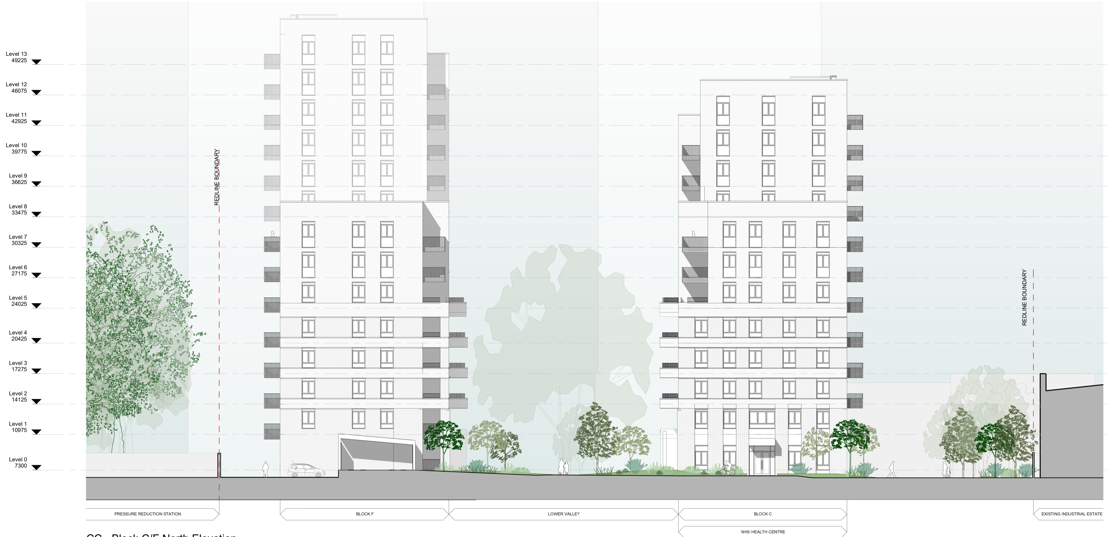
CC - Block C/F North Elevation

GENERAL NOTES: This drawing is © 2023 PTE architects. Use figured dimensions only. All dimensions are in millimetres unless noted otherwise. This drawing must be read in conjunction with all other relevant drawings and specifications from the Architect and other consultants. If in doubt, ask. SETTING OUT NOTES: All setting out to be confirmed on site prior to construction - any discrepancy must be immediately reported to the Architect. All partitions set out to studwork or structure. For setting out and specification of M&E services refer to M&E Consultants documents. For setting out and specification of structure refer to Structural Engineer's documents. 2 0 2 4 10 m Metres 1:200 N