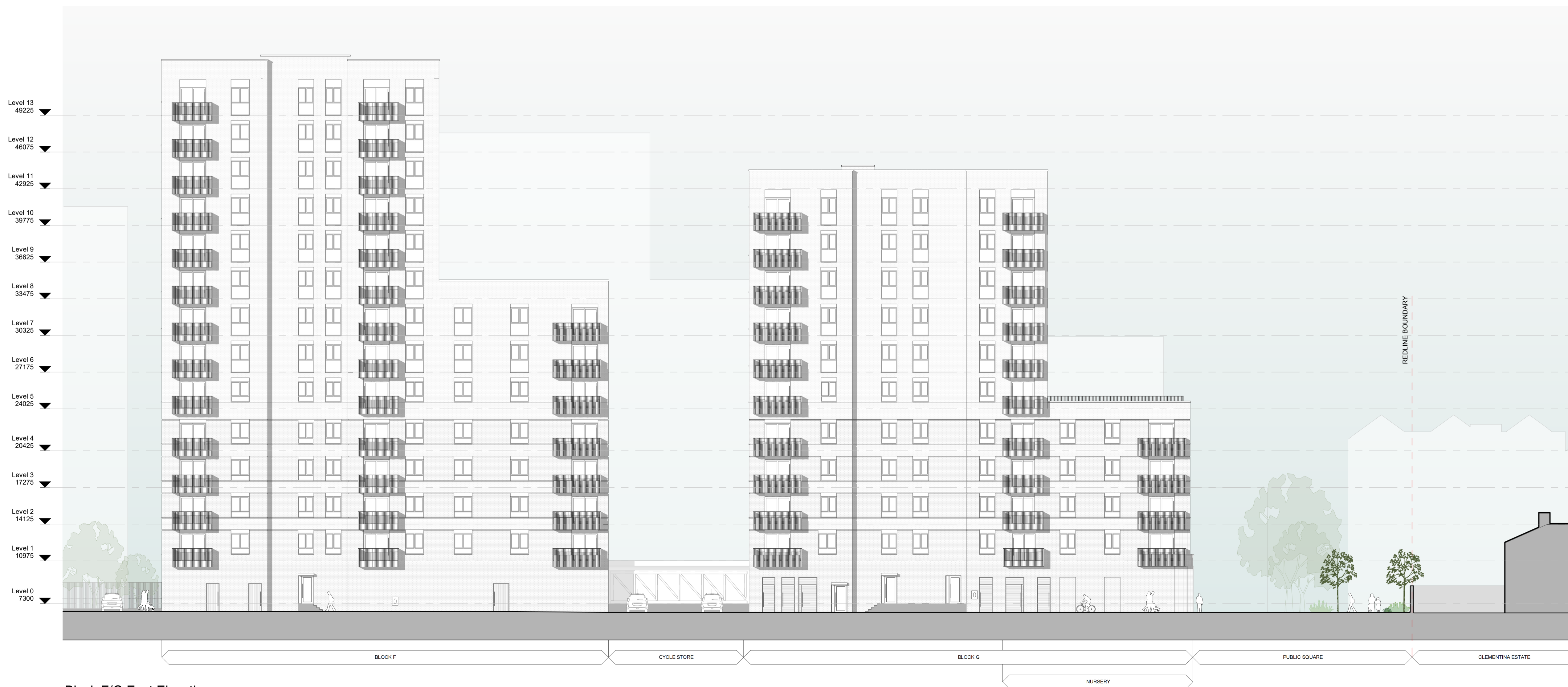
Block F/G East Elevation