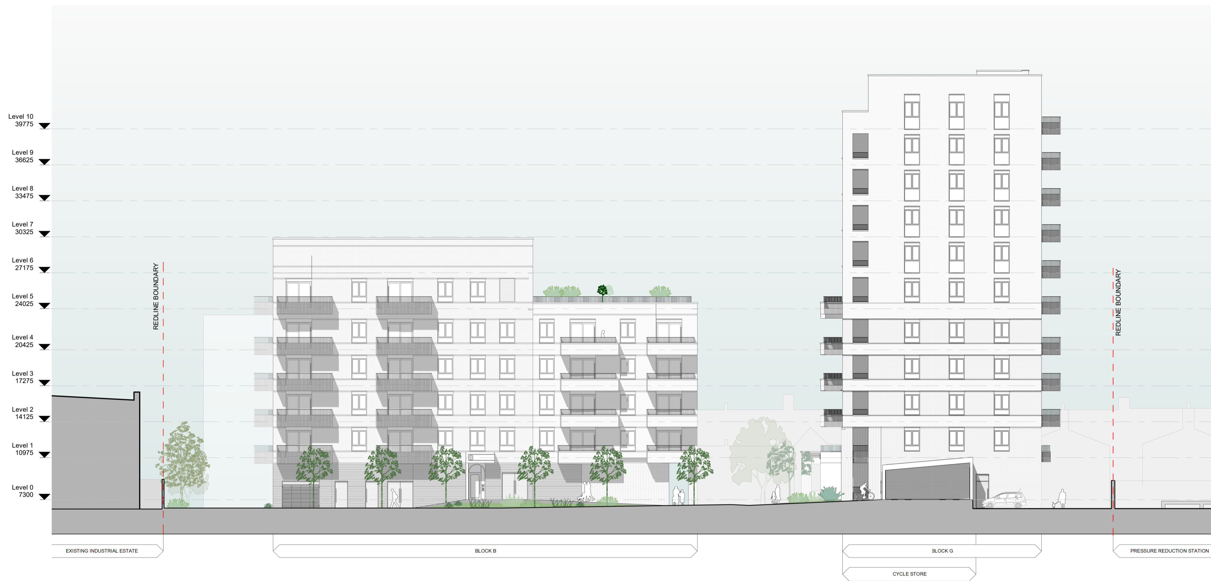
Block B/G South Elevation