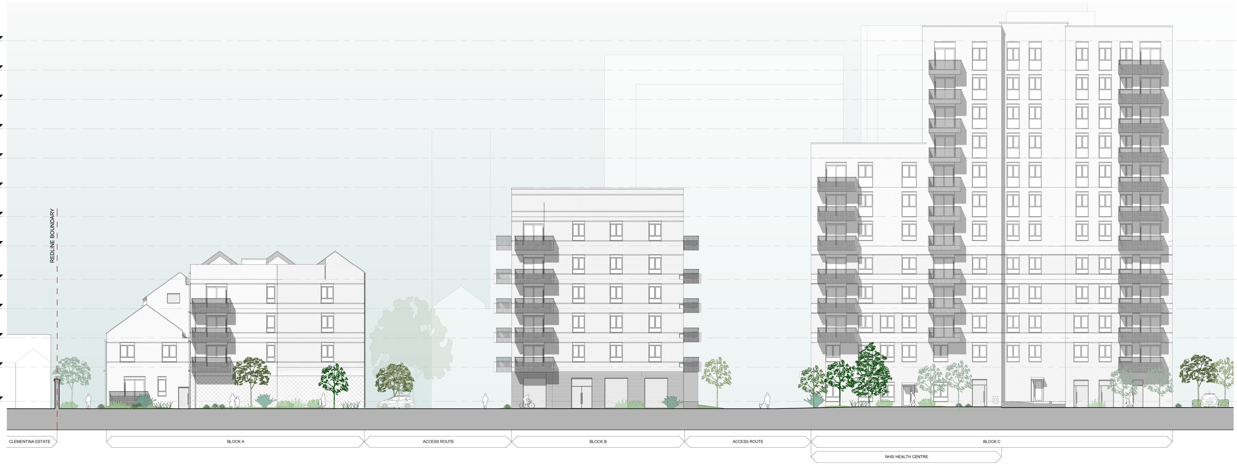
BB - Block A/B/C West Elevation