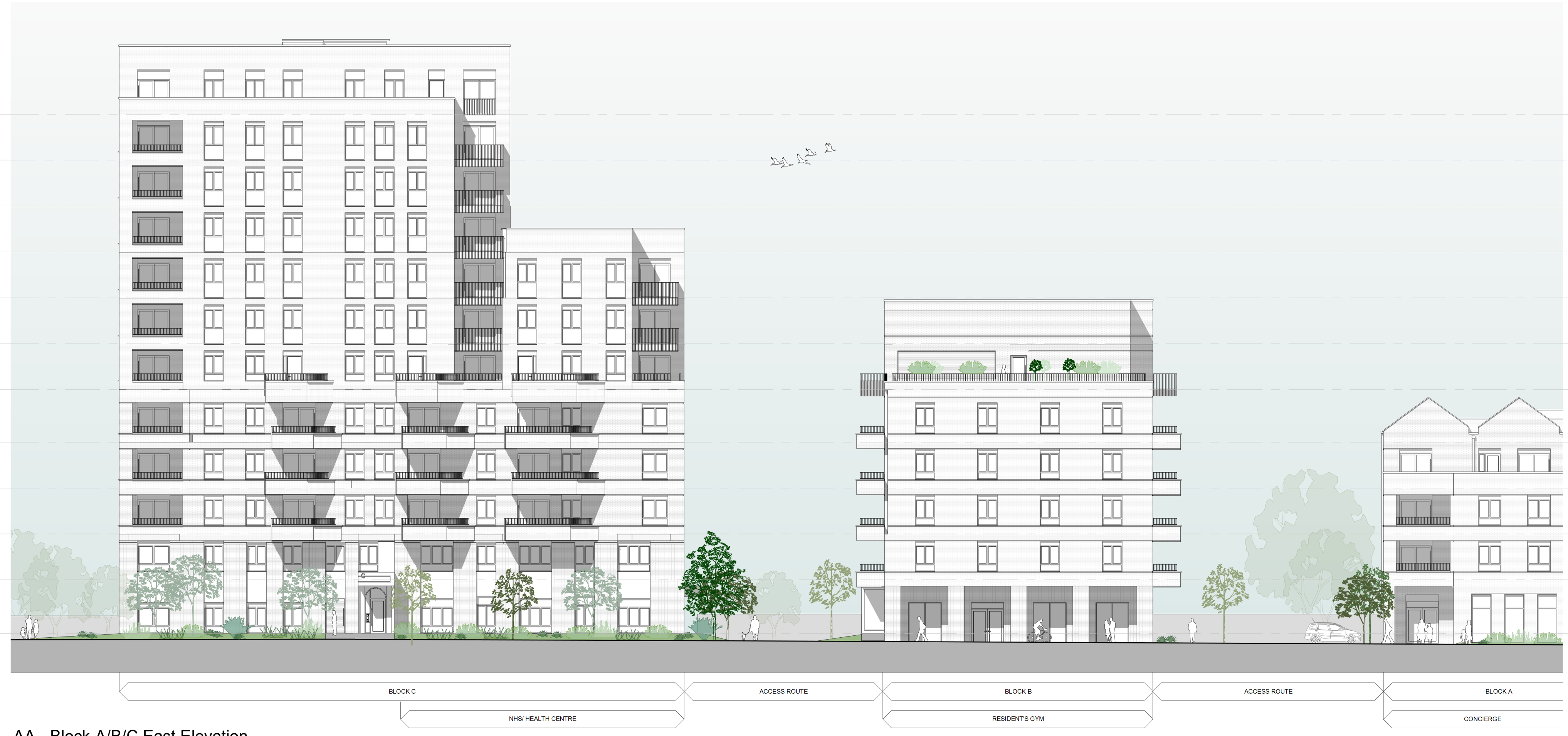
AA - Block A/B/C East Elevation