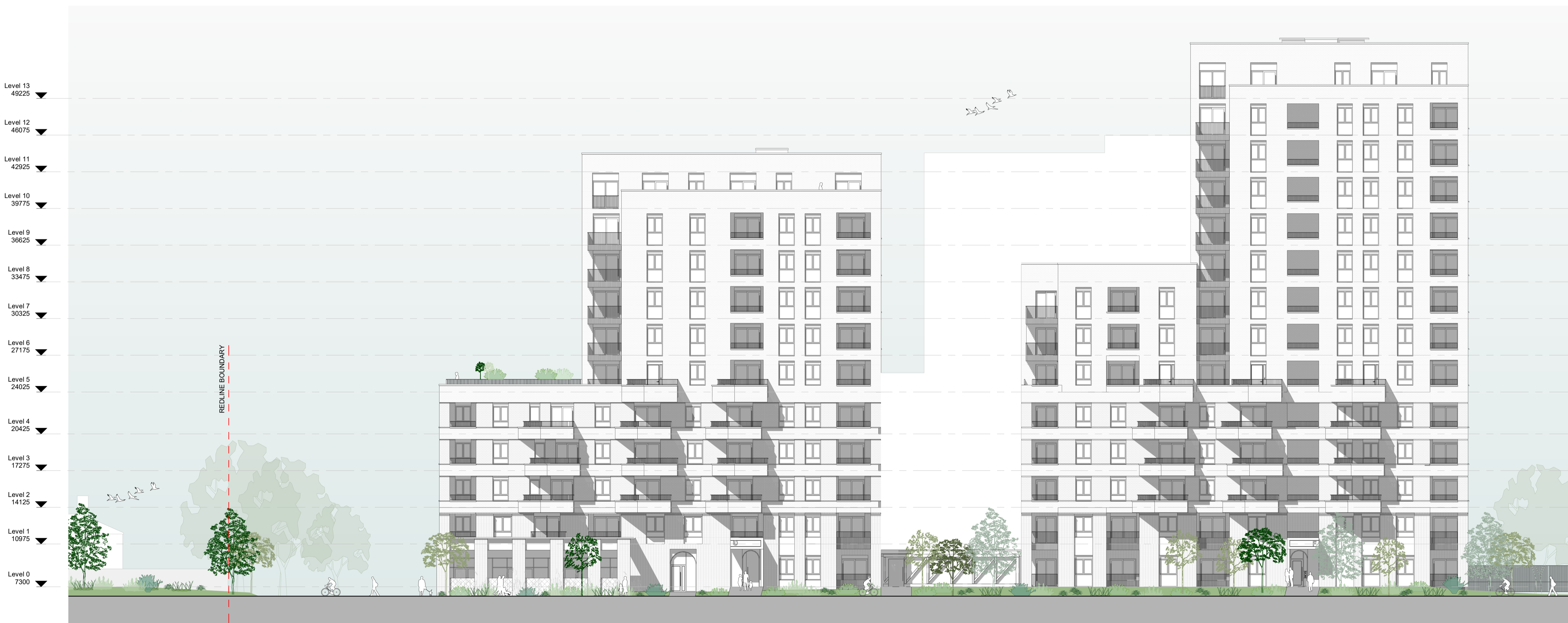
CC - Block F/G West Elevation