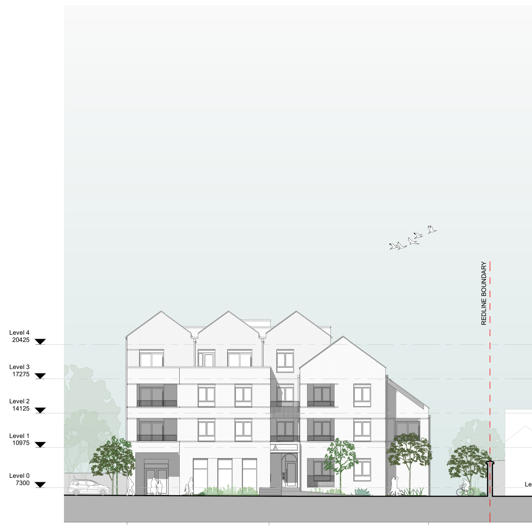
AA - Block A East Elevation