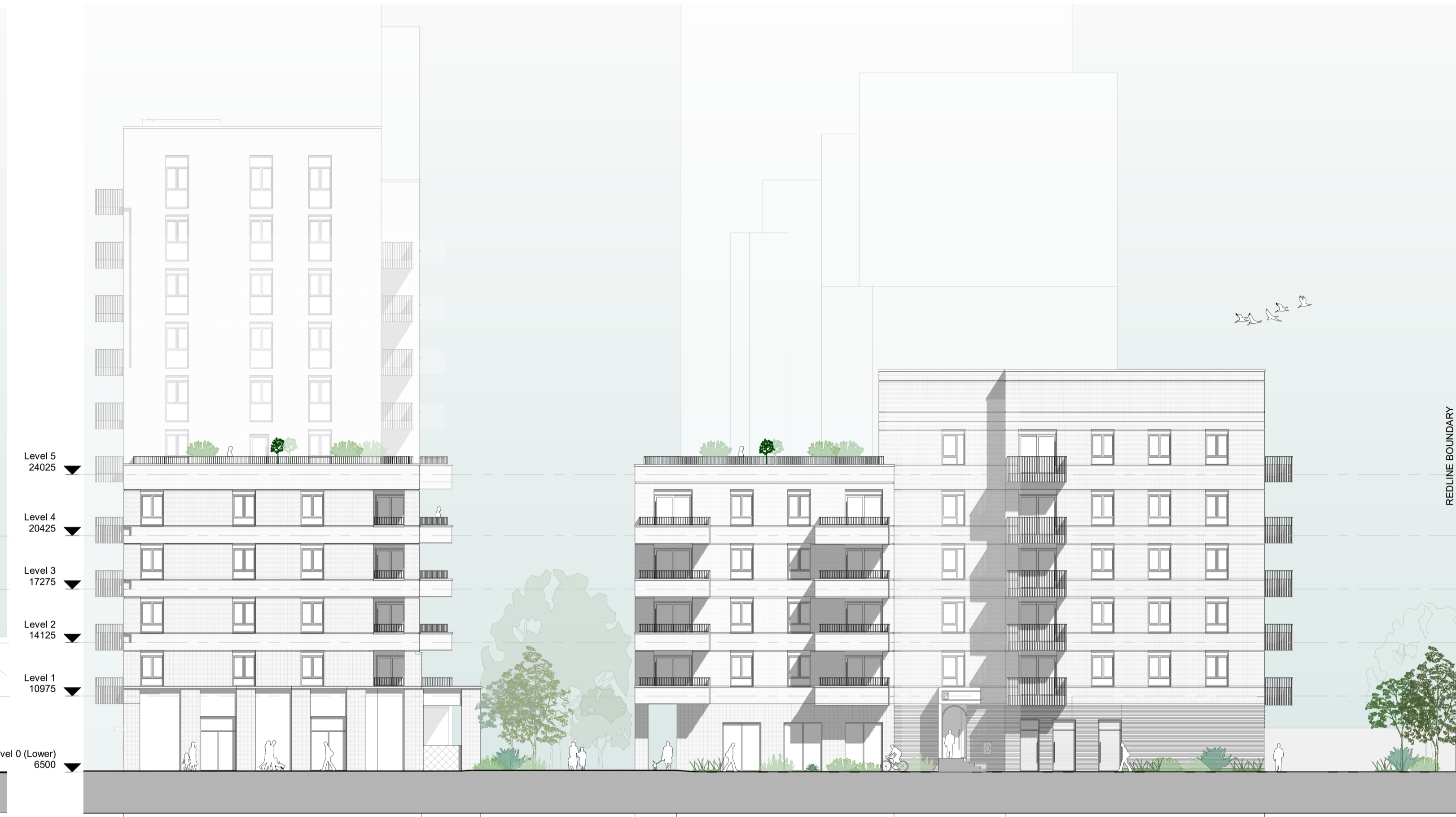
BB - Block B/G North Elevation