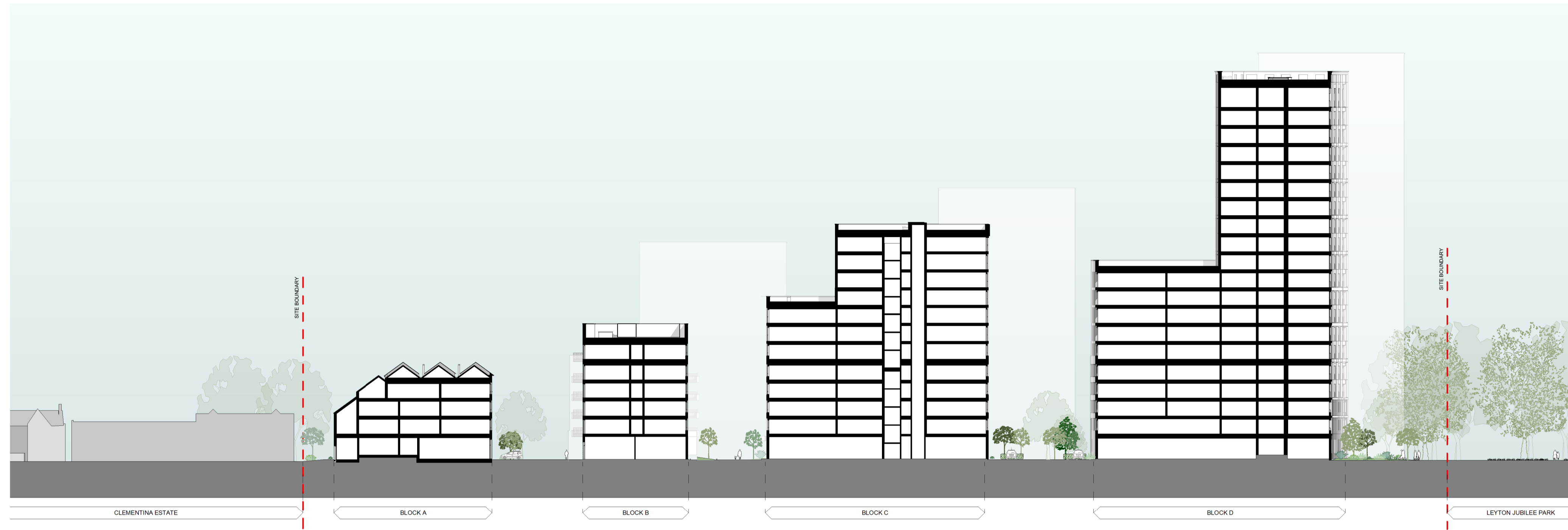
Site Section A-A