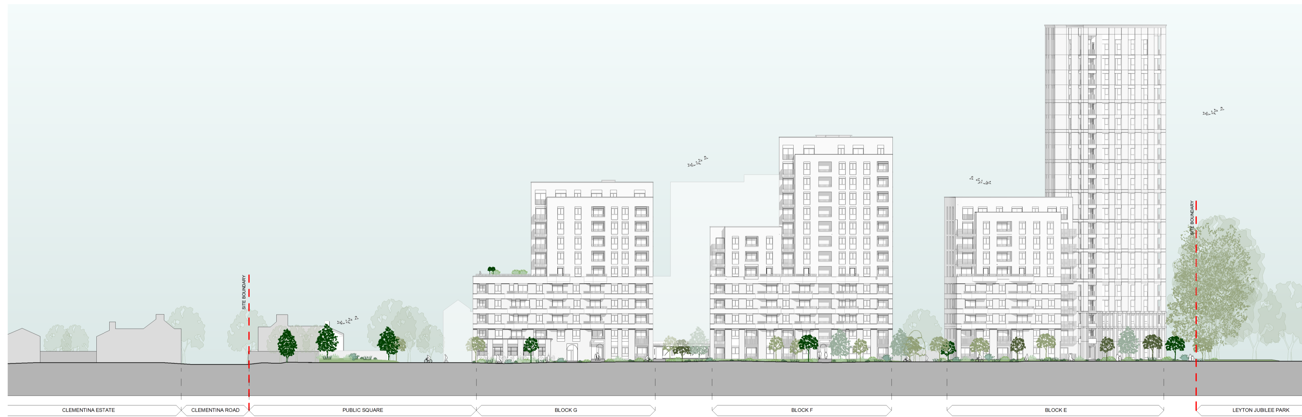
Site Section B-B