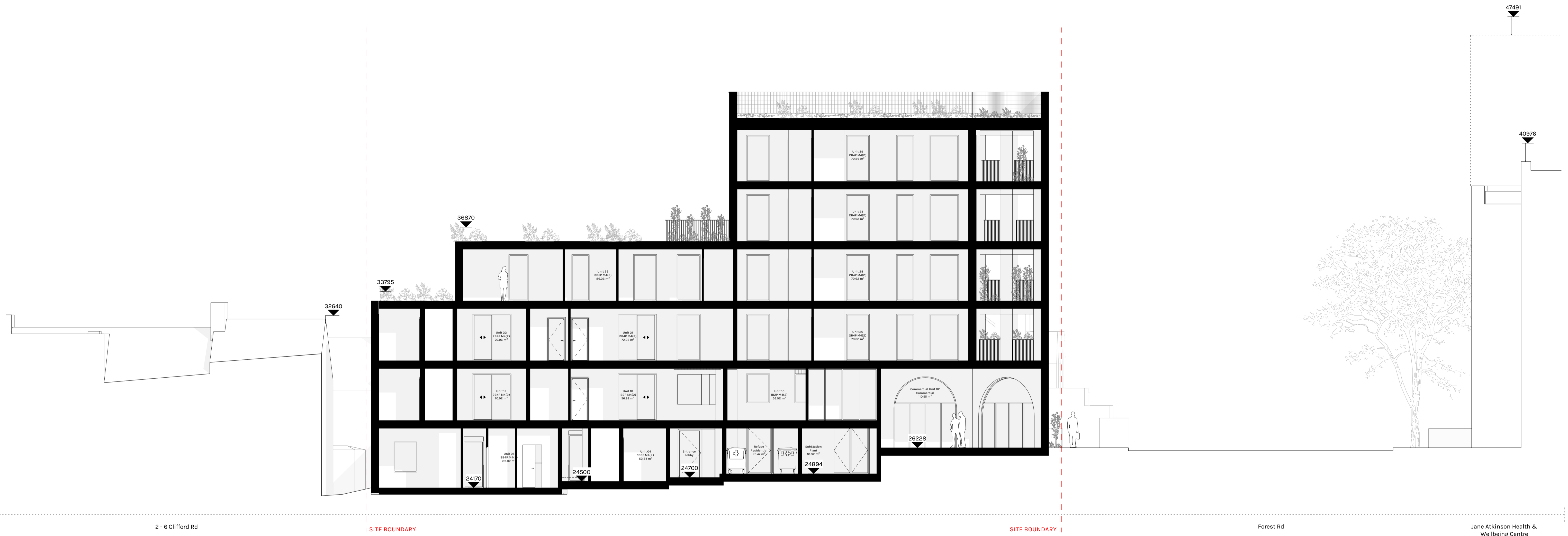
Proposed Section B-B 1:100