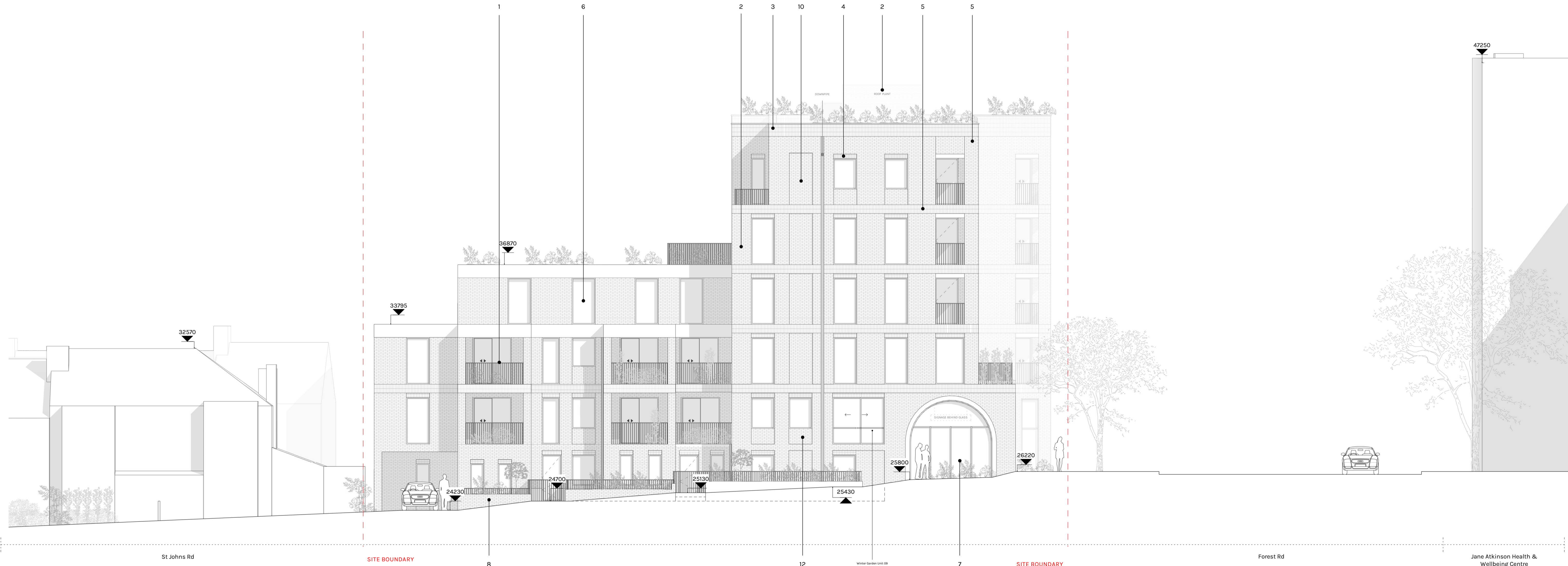
Proposed West Elevation 1 : 100