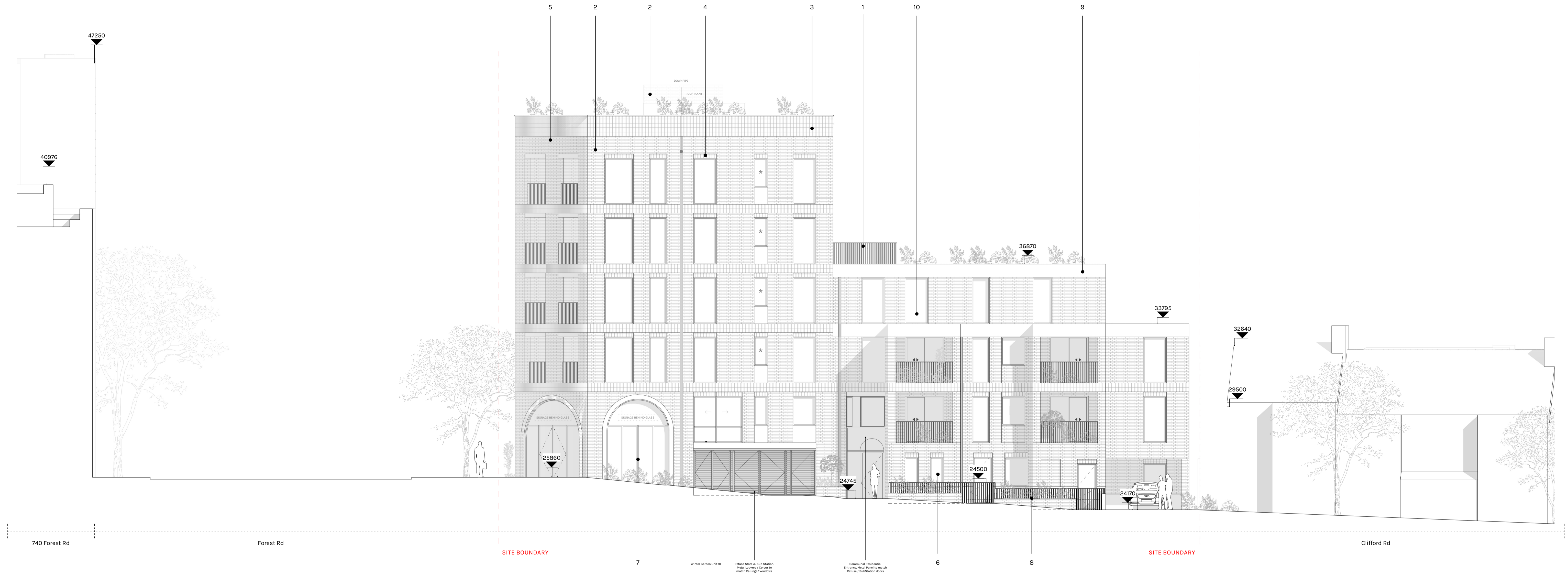
Proposed East Elevation 1 : 100