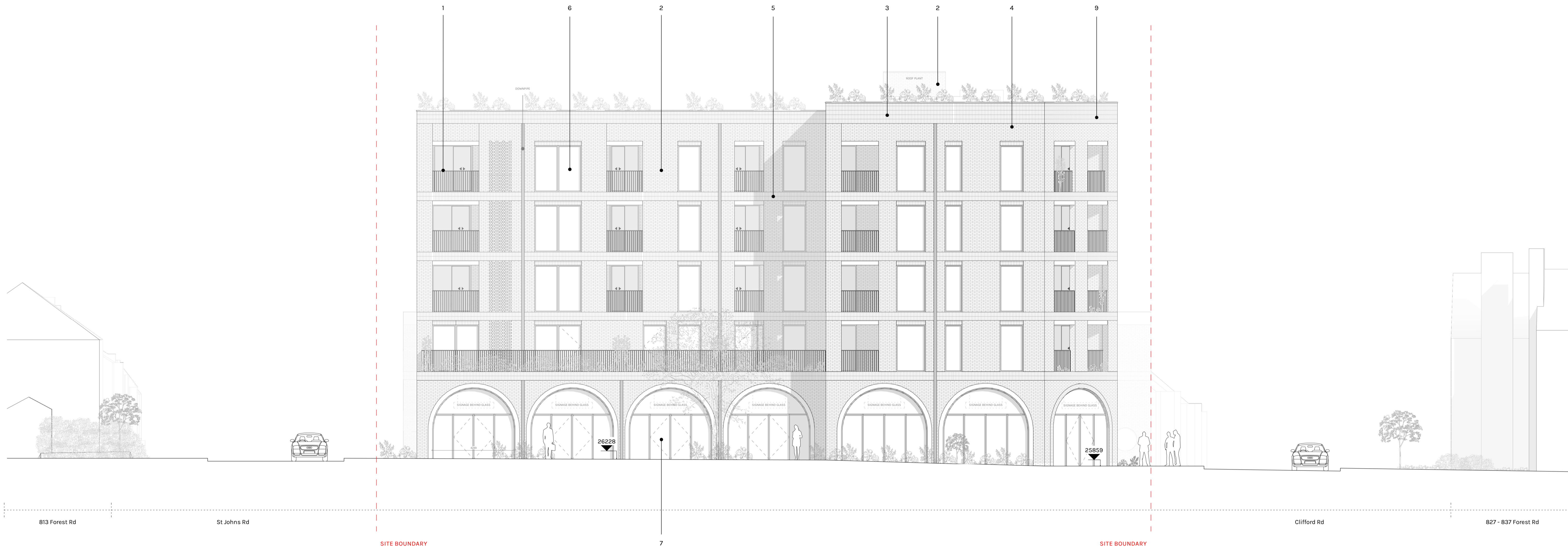
Proposed South Elevation 1:100