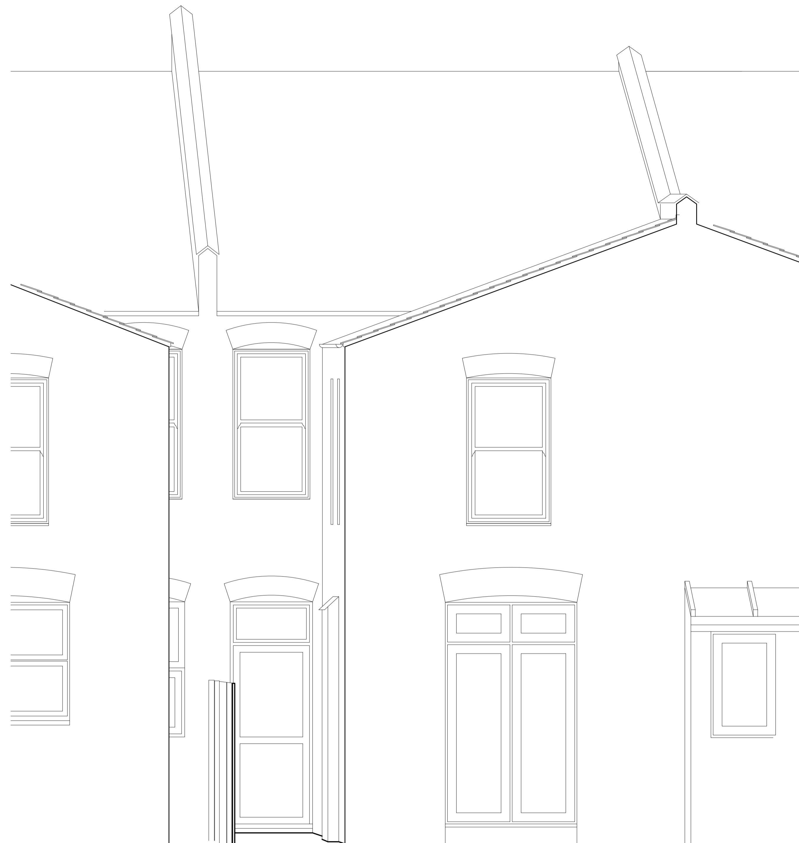
02 Rear Elevation 1:25 @ A1