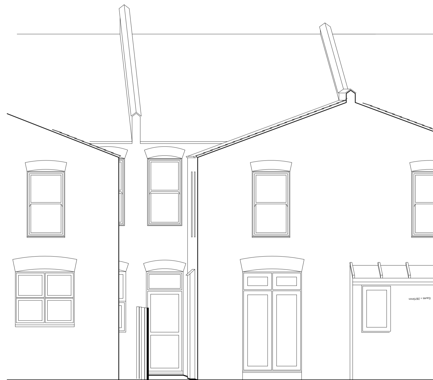
01 Rear Elevation 1:50 @ A1