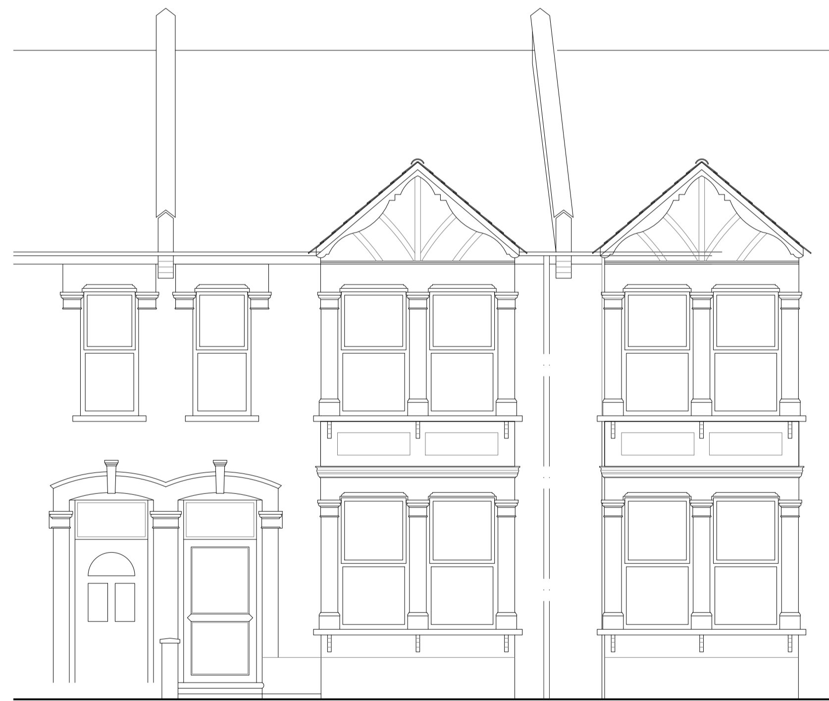
01 Front Elevation 1:50 @ A1