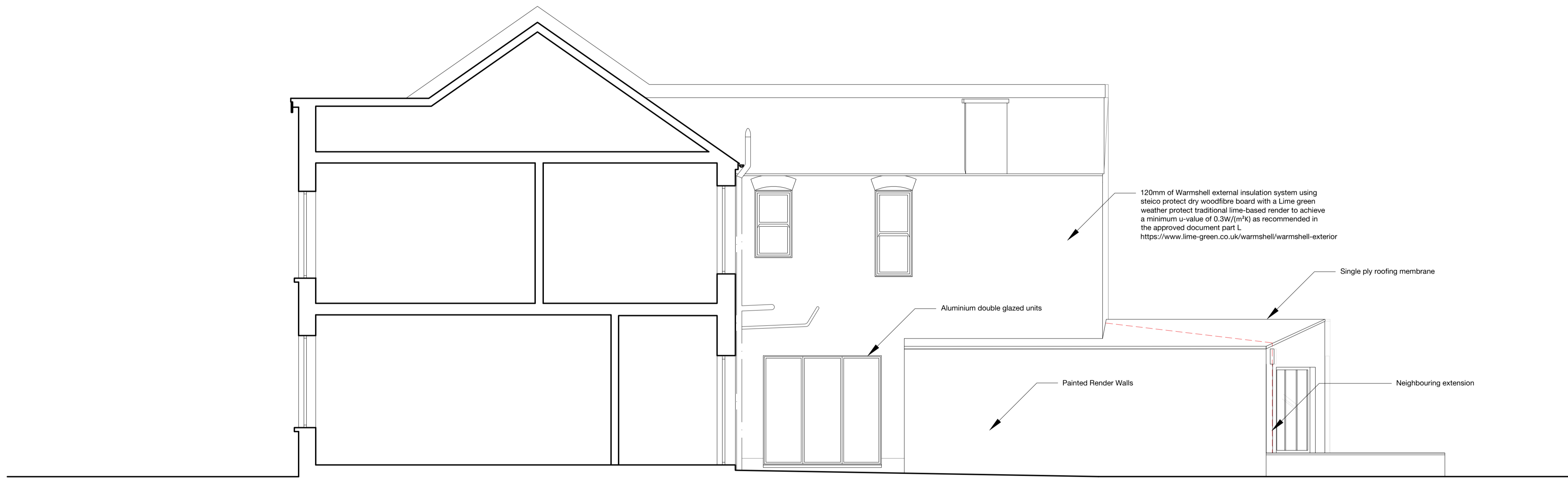
01 Side Elevation 1:50 @ A1