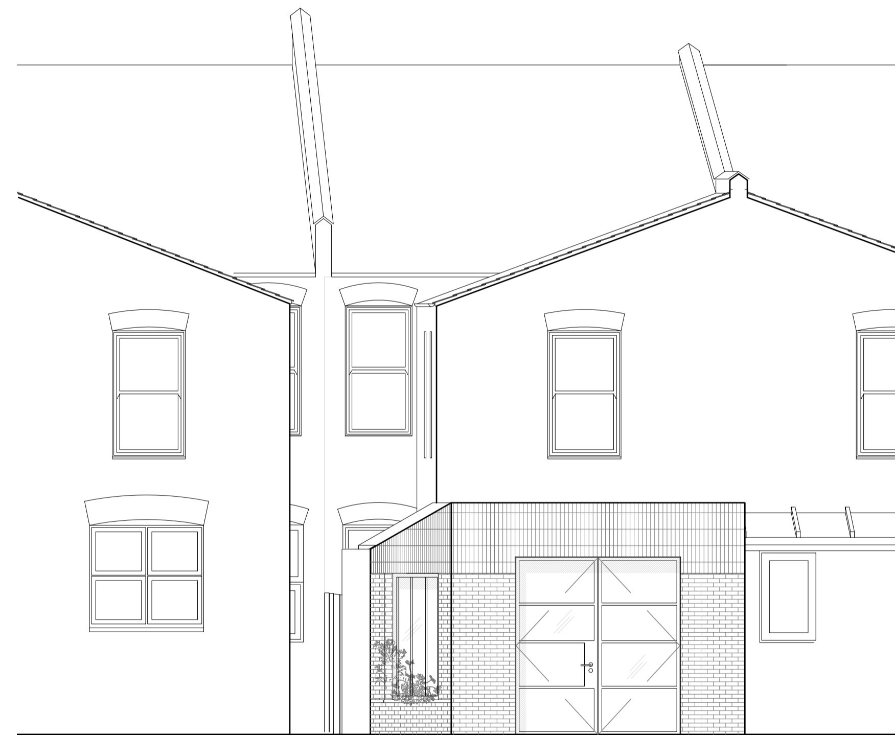
01 Rear Elevation 1:50 @ A1