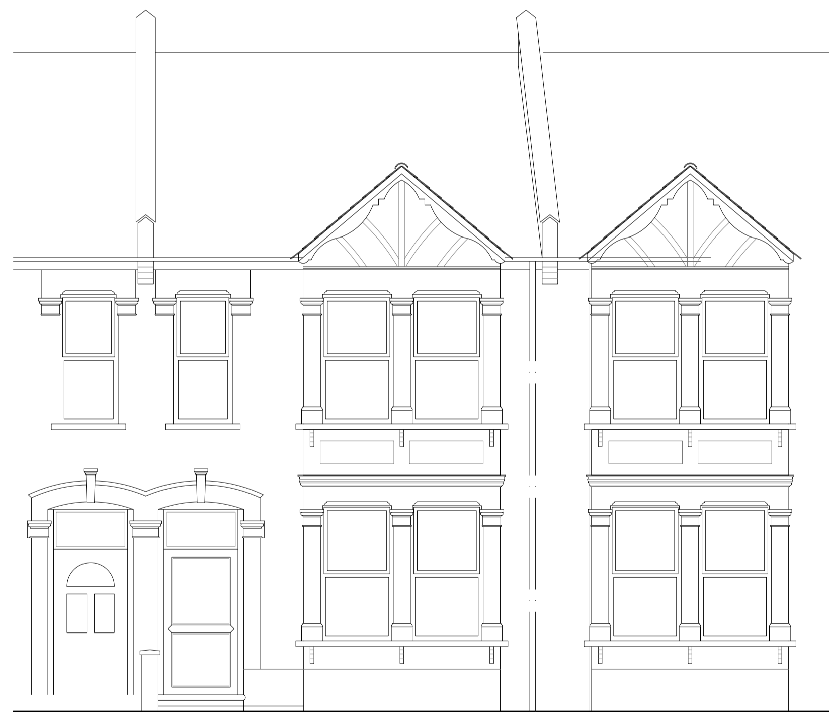
01 Front Elevation 1:50 @ A1