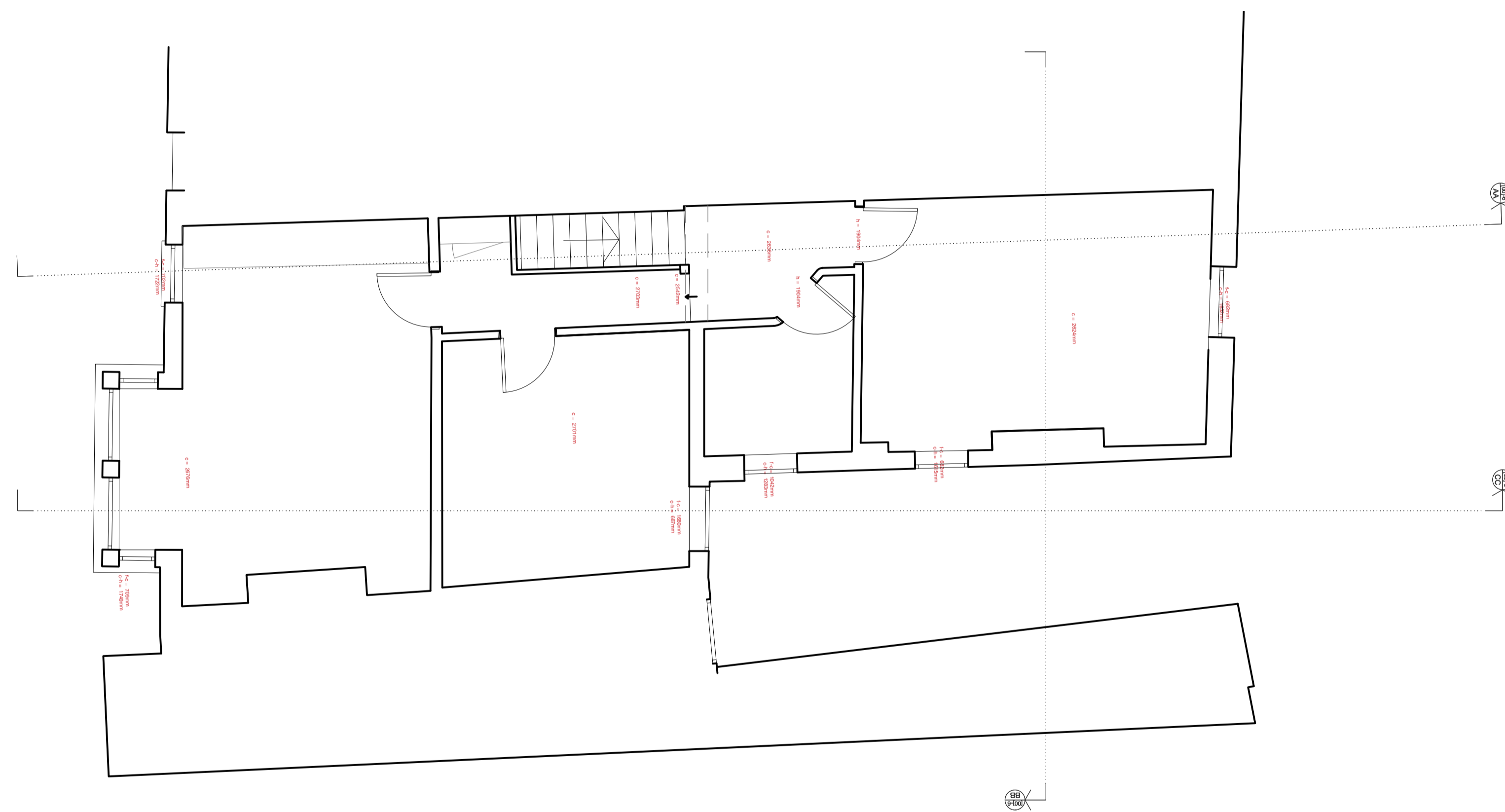
01 First Floor Plan 1:50 @ A1