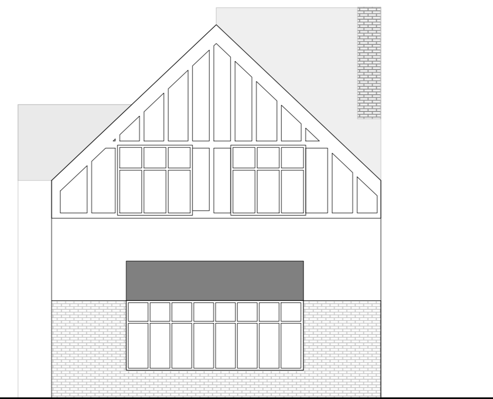
Elevation Mount Echo Drive