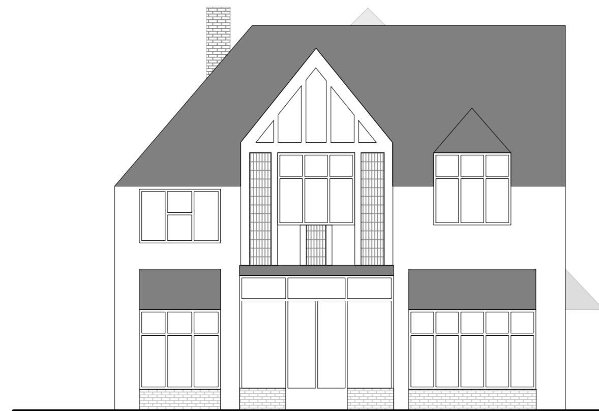
Elevation Mount Echo Avenue