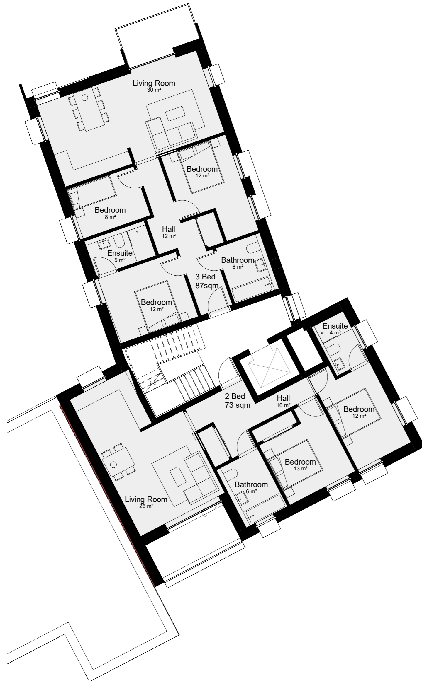
Building 1 - 2nd floor 1 : 100