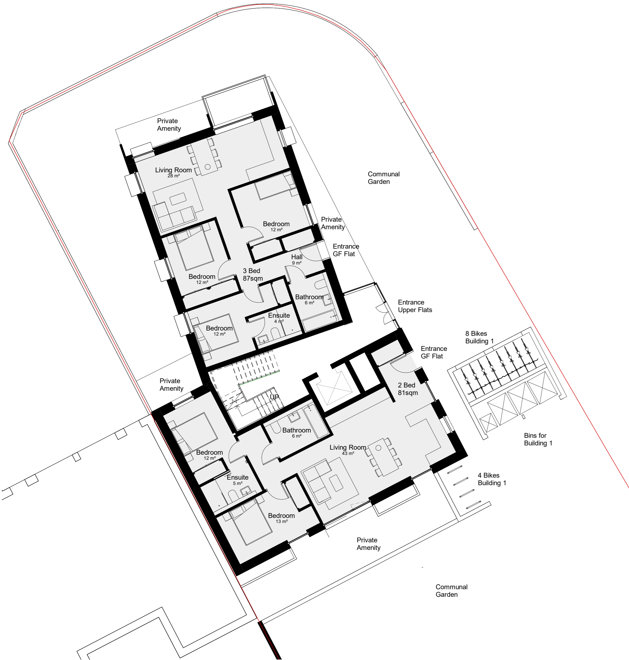
Buidling 1 - Ground Floor_Entry Level