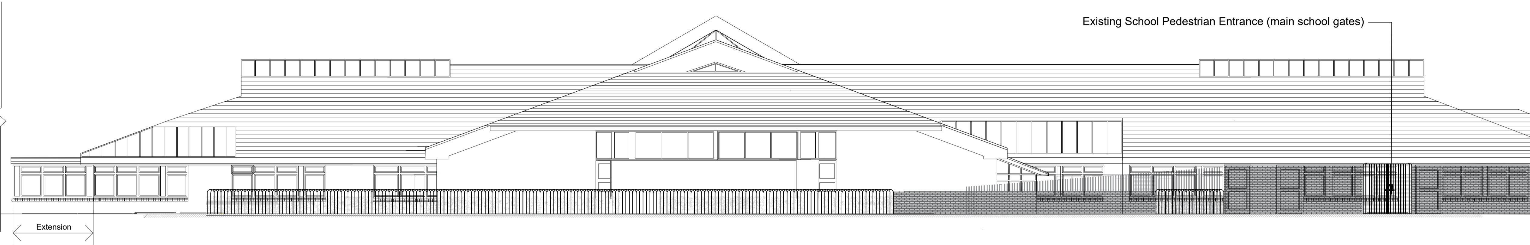
PROPOSED ELEVATION C - C (South West) FRONT ELEVATION