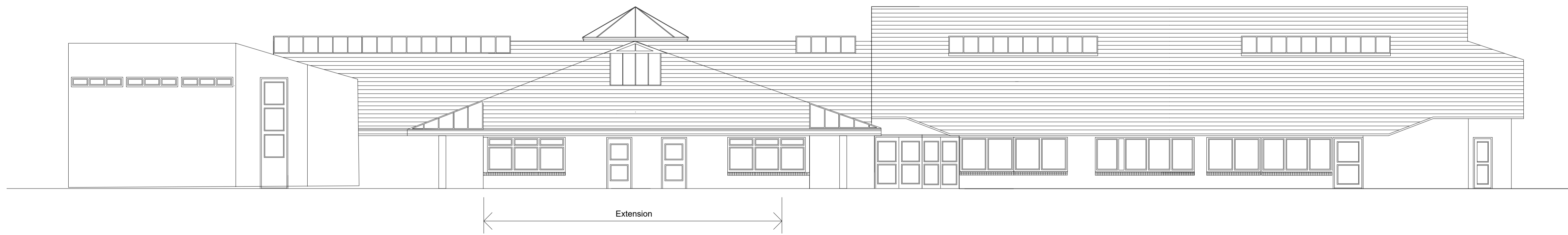
PROPOSED ELEVATION D - D (North West)