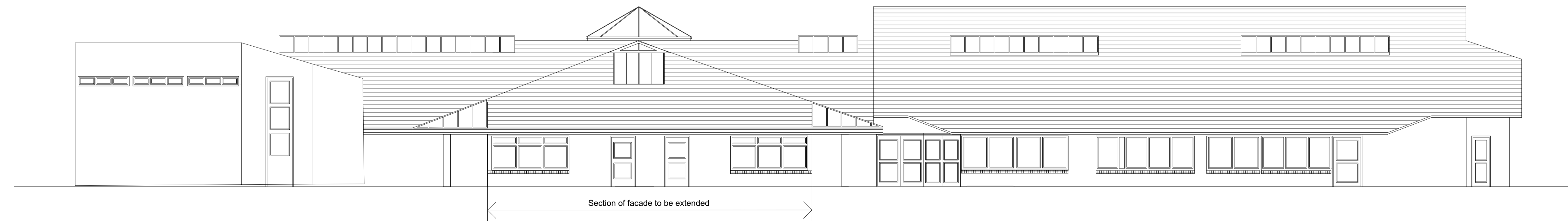
EXISTING ELEVATION D - D (North West)