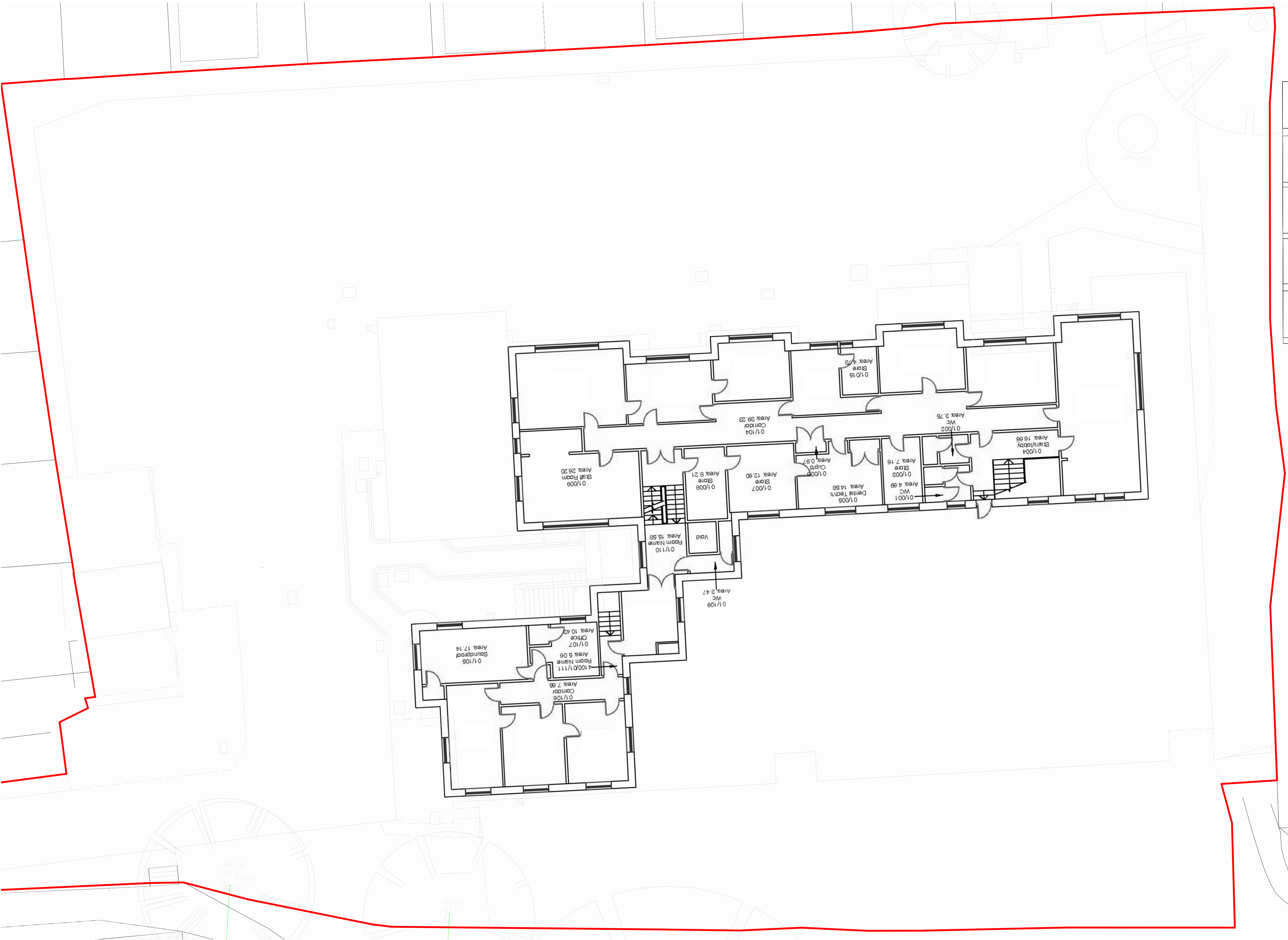
1 Level 0 Existing FF Scale: 1 : 100

GENERAL NOTES: This drawing is © 2019 Pollard Thomas Edwards LLP (PTE). Use figured dimensions only. DO NOT SCALE. All dimensions are in millimetres unless noted otherwise. This drawing must be read in conjunction with all other relevant drawings and specifications from the Architect and other consultants. If in doubt, ask. SETTING OUT NOTES: All setting out to be confirmed on site prior to construction - any discrepancy must be immediately reported to the Architect. All partitions set out to studwork or structure. For setting out and specification of M&E services refer to M&E Consultants documents. For setting out and specification of structure refer to Structural Engineer's documents.