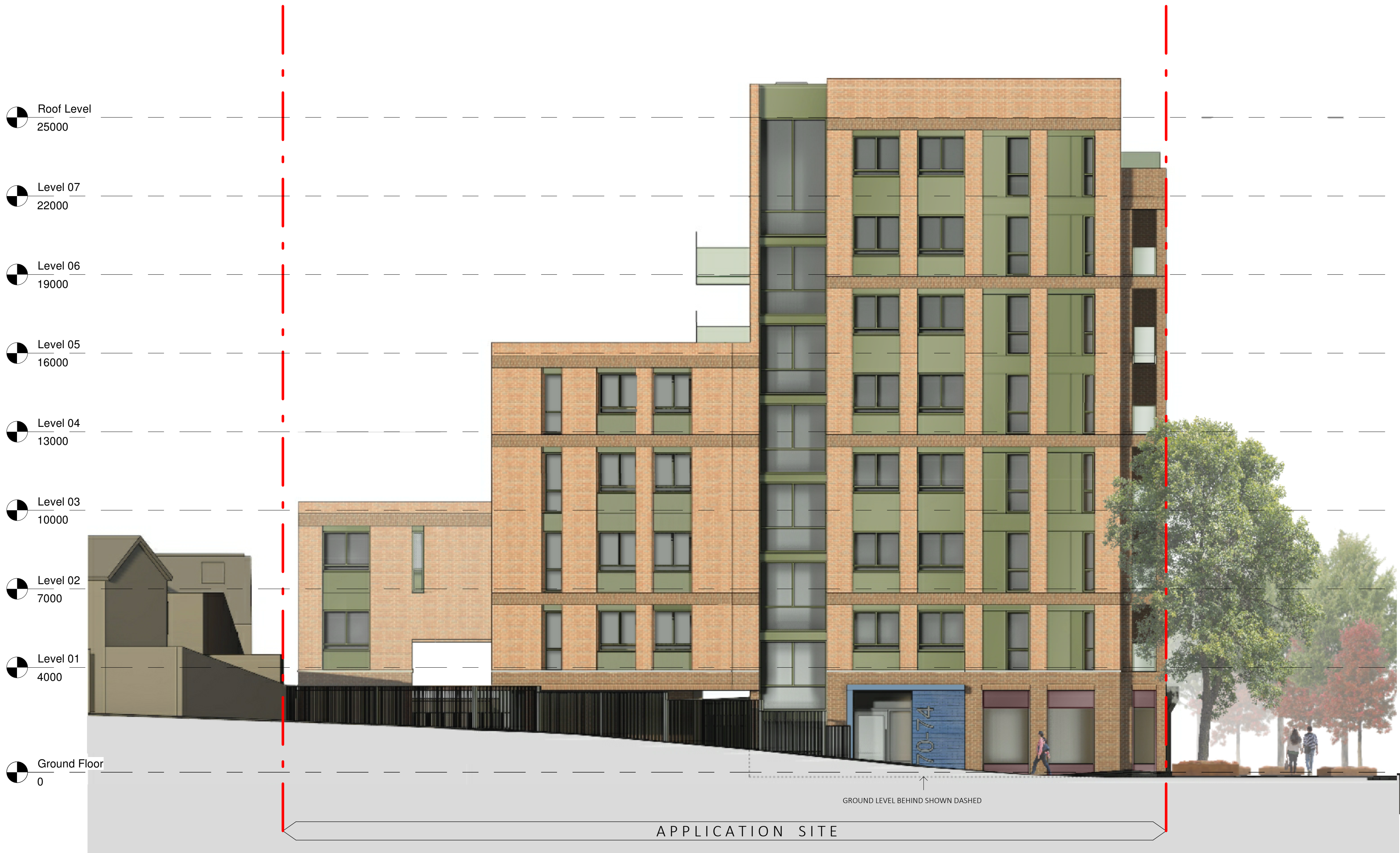
1 East Elevation Scale: 1 : 100