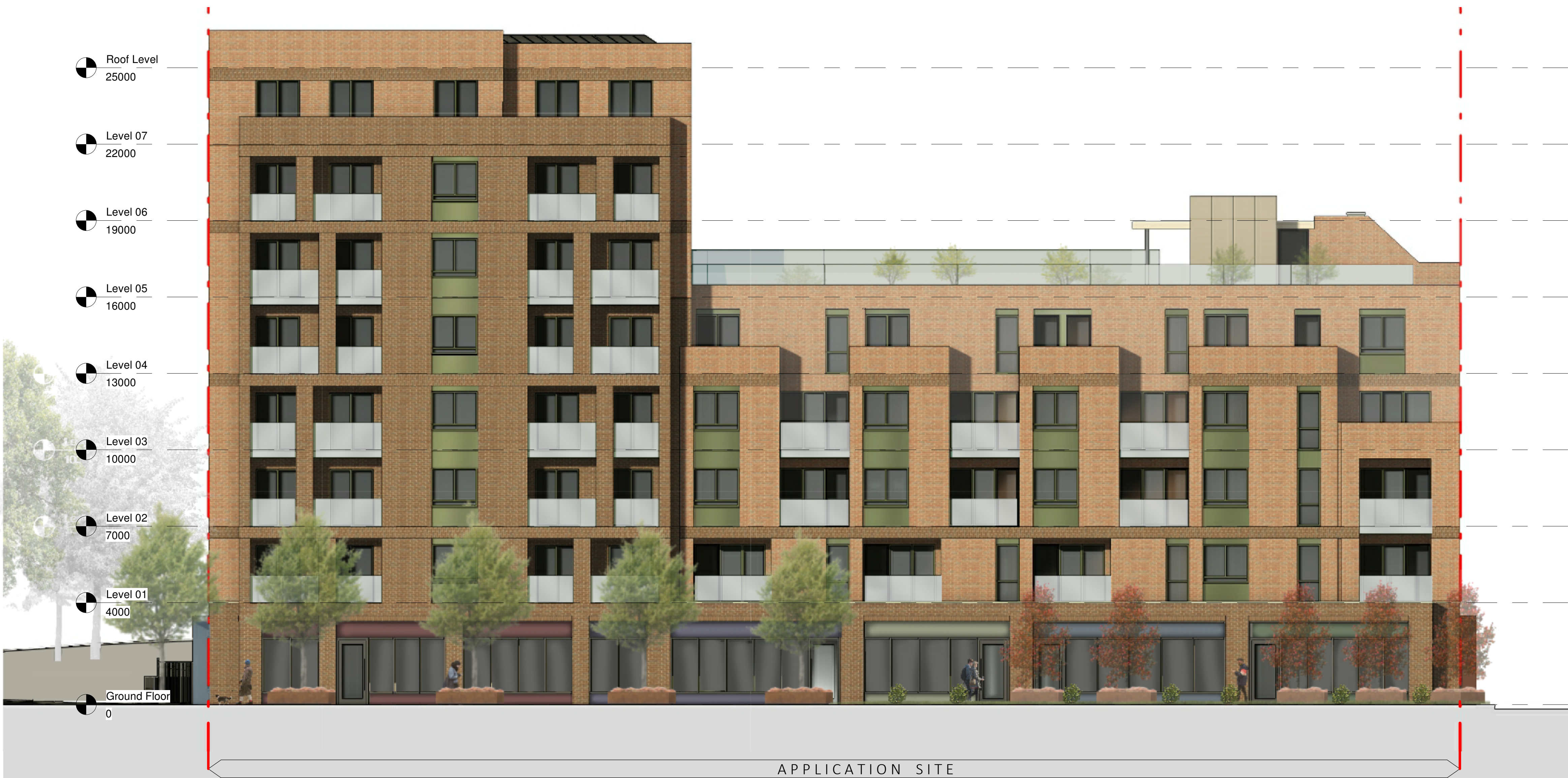
1 North Elevation Scale: 1 : 100