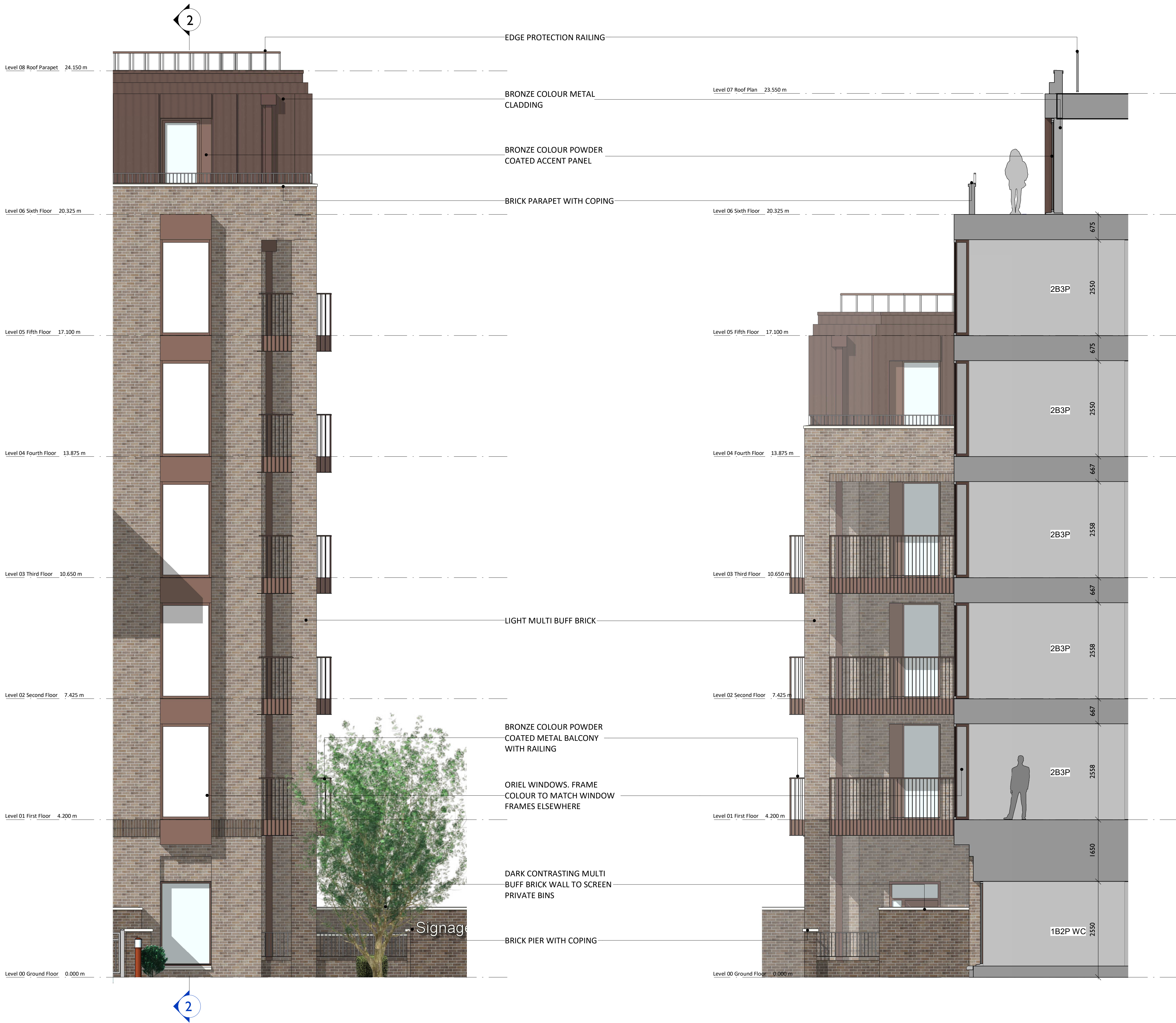
BLOCK B FACADE STUDY - NORTH ELEVATION 1 : 50