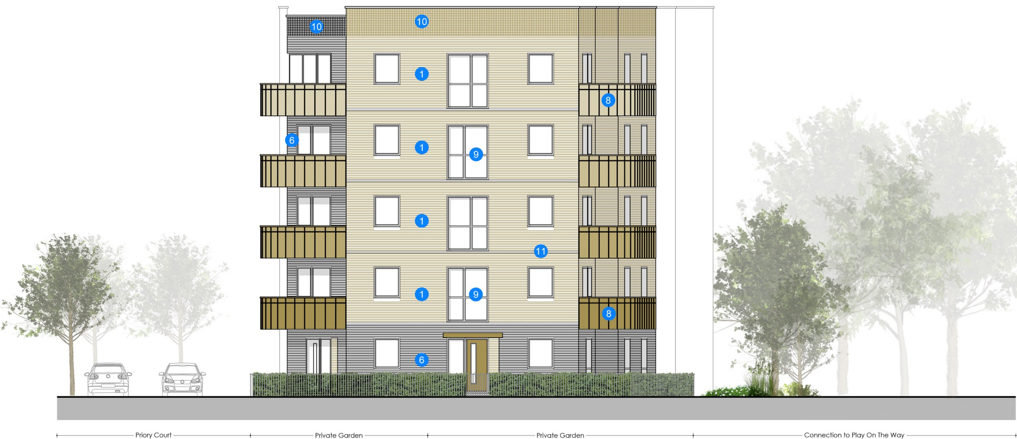
Side Elevation (South Facing - Fronting Priory Court Road)