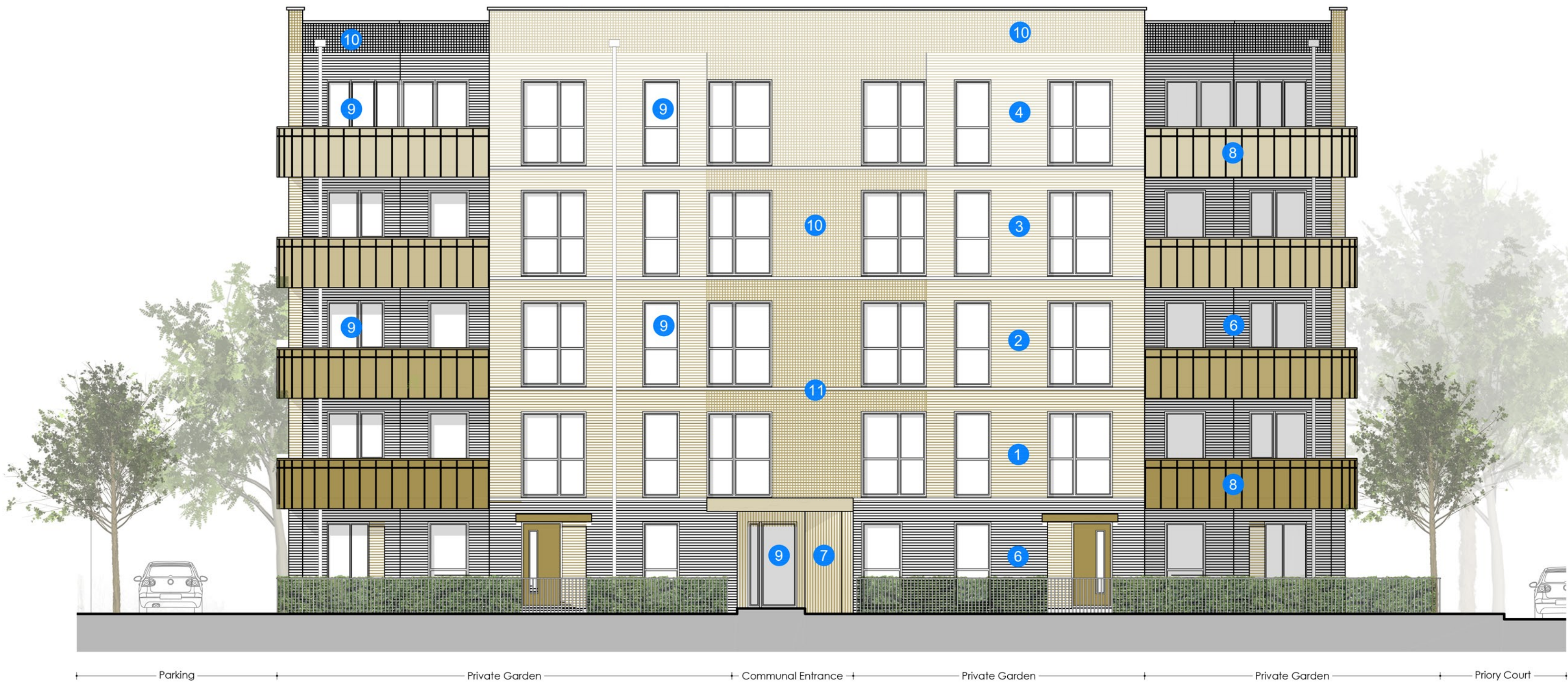
Front Elevation (West Facing - Fronting Eastleigh Road)

Project No. Drawing No. Status Revision 20.112 0300 A3 003