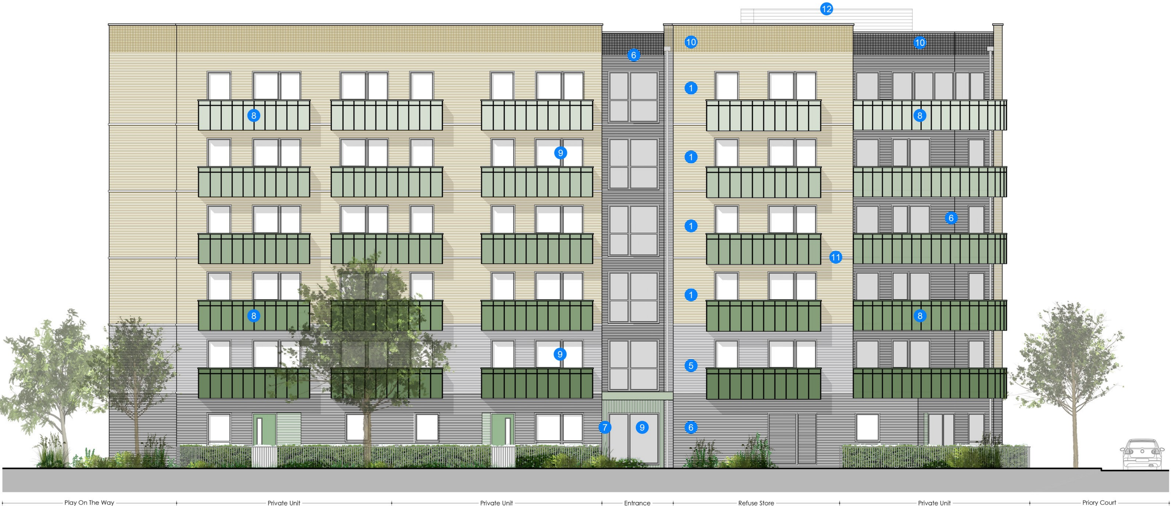
Side Elevation (South Facing - Fronting Existing Washington House)