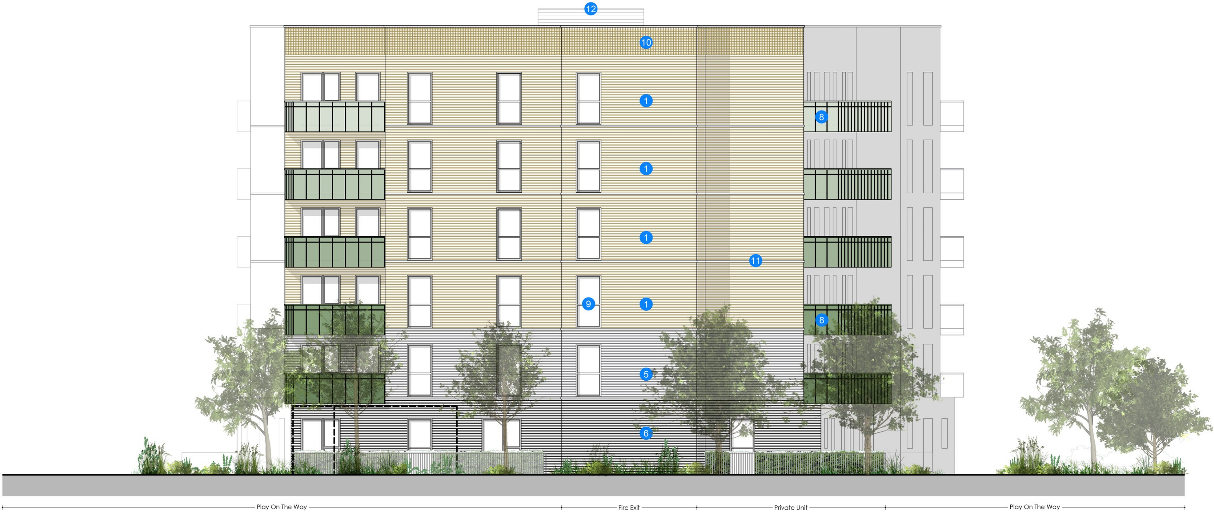
Rear Elevation (West Facing - Fronting Existing Vermont House)

Project No. Drawing No. Status Revision 20.112 0301 A3 003