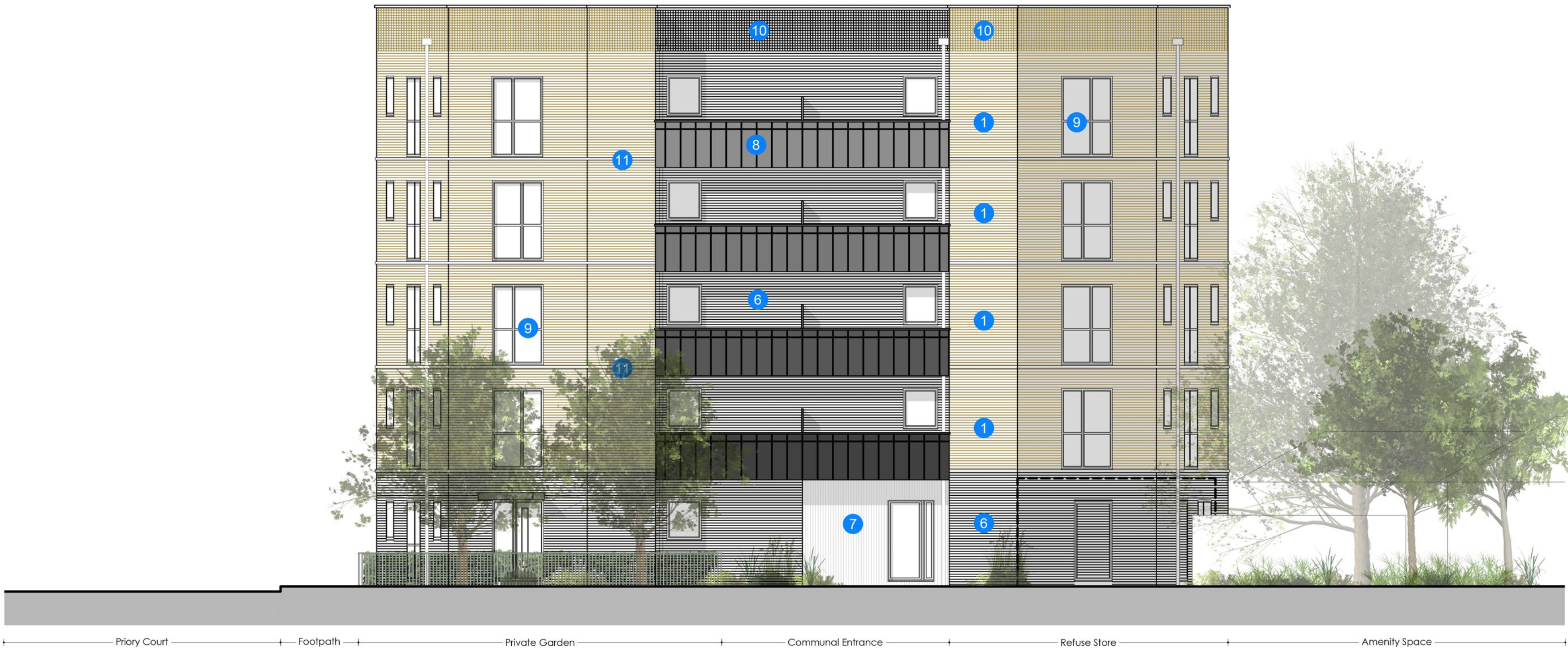
Rear Elevation (West Facing - Fronting Sherwood Close)

Project No. Drawing No. Status Revision 20.112 0301 A3 003