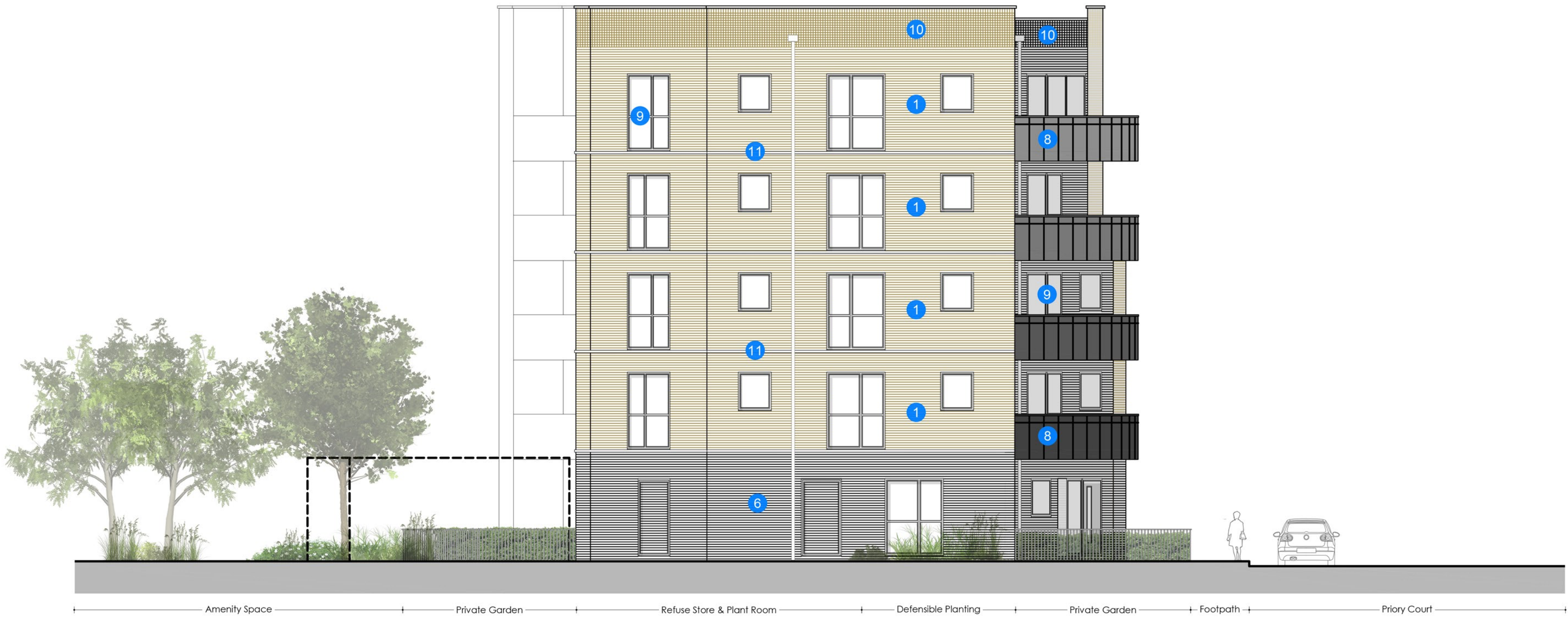
Side Elevation (South Facing - Fronting Existing Clinic Building)