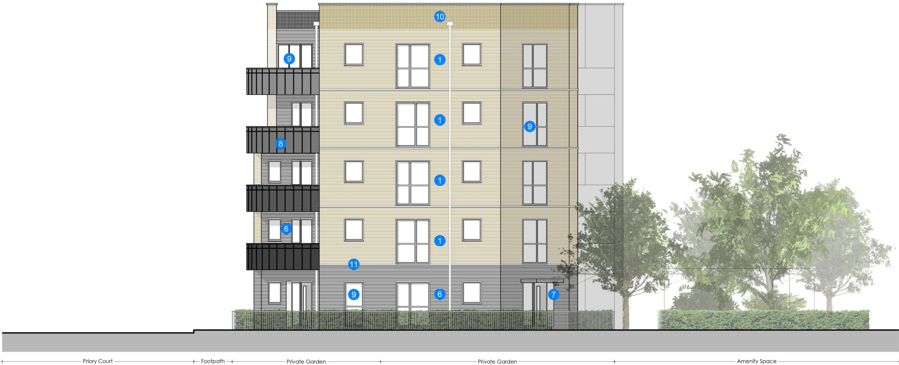
Side Elevation (North Facing - Fronting Sherwood Close)