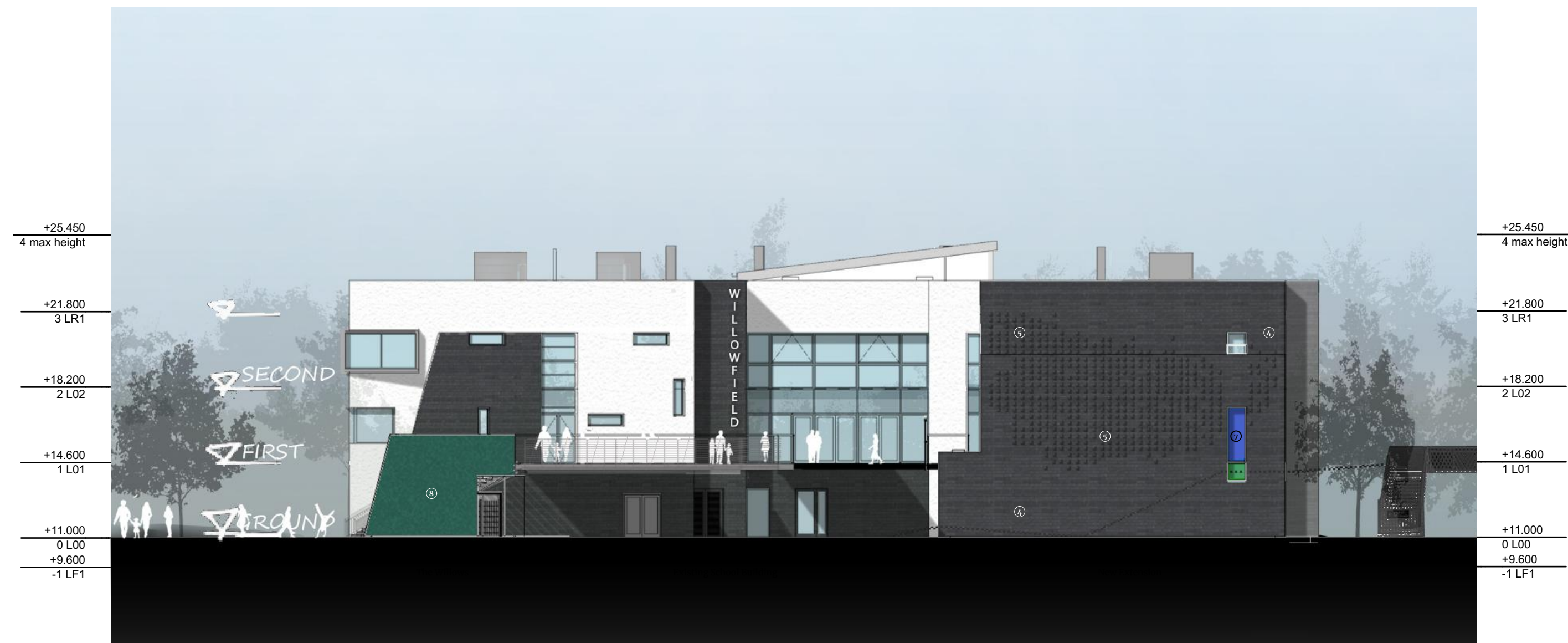
0000 PROPOSED EAST ELEVATION

Notes Check all dimensions on site. Do not scale from this drawing Report any discrepancies and omissions to HLM Architects This Drawing is Copyright ©