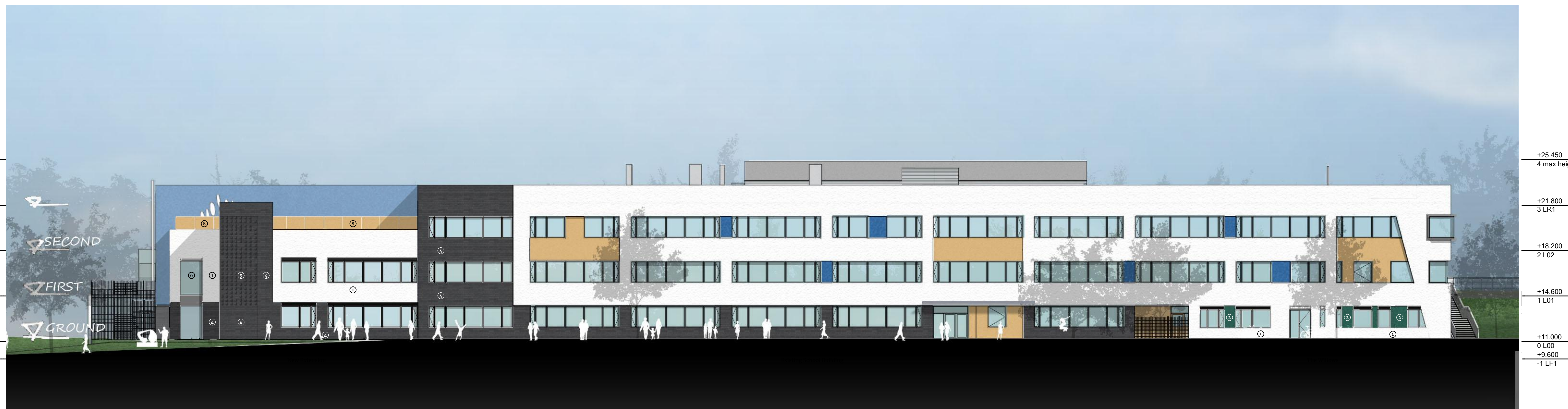
0000 PROPOSED SOUTH ELEVATION - GRAPHICAL