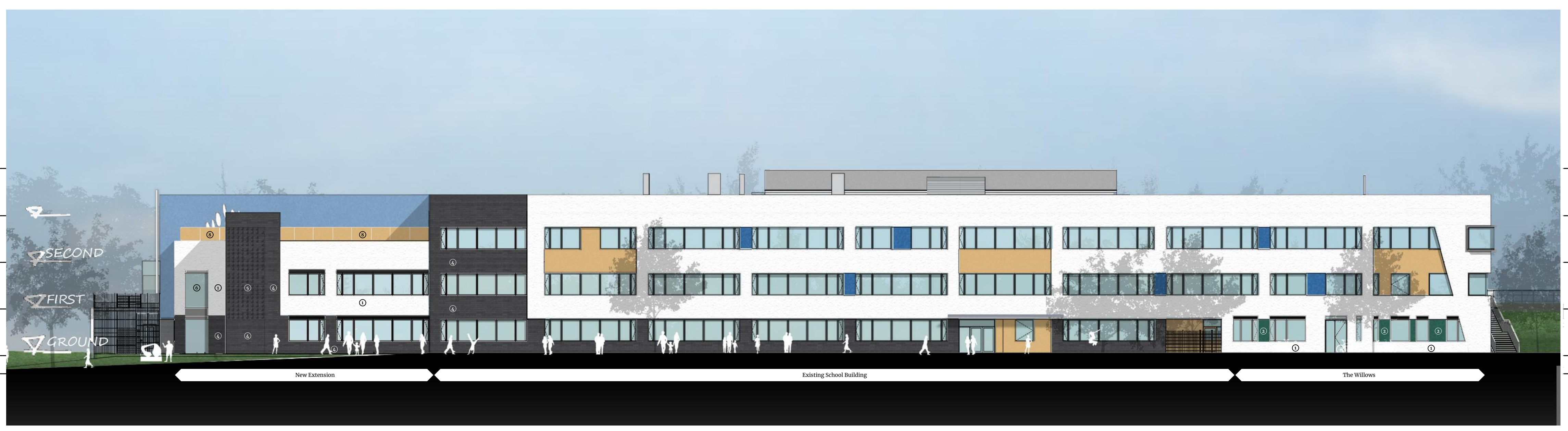
0000 PROPOSED SOUTH ELEVATION - GRAPHICAL