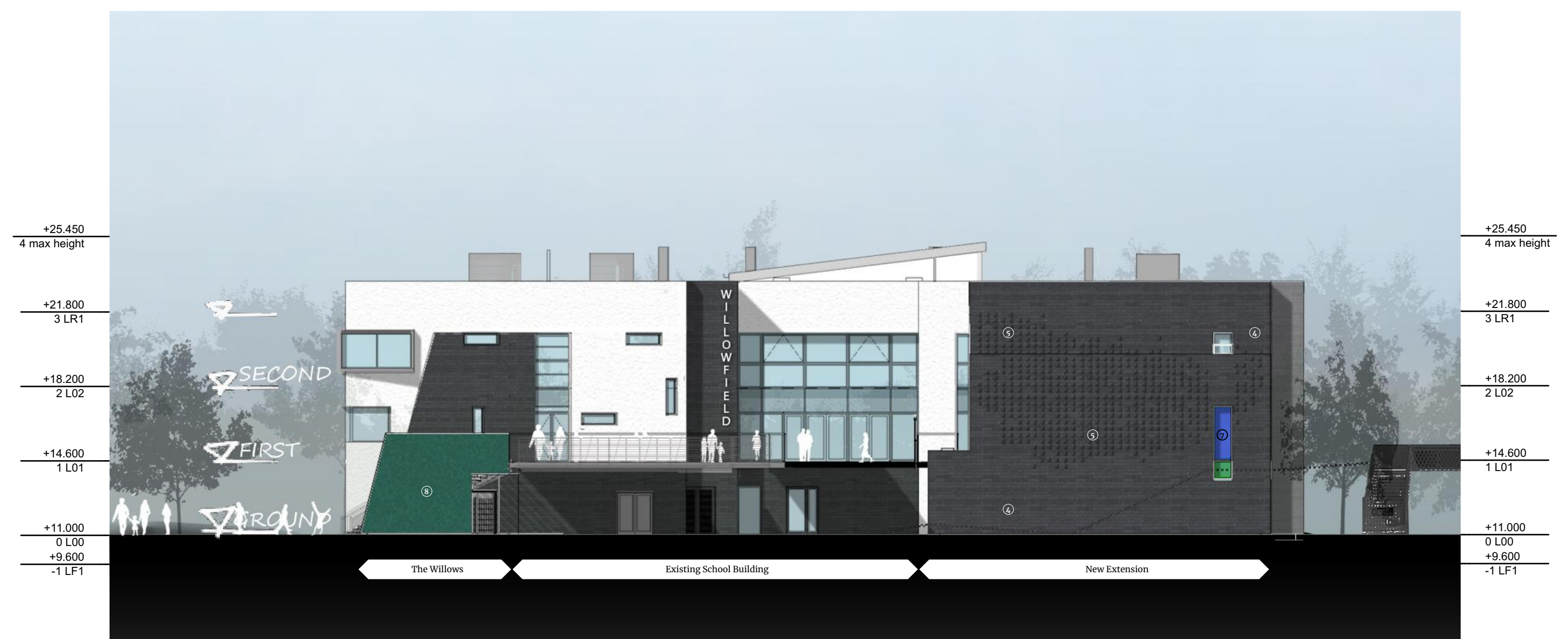
0000 PROPOSED EAST ELEVATION