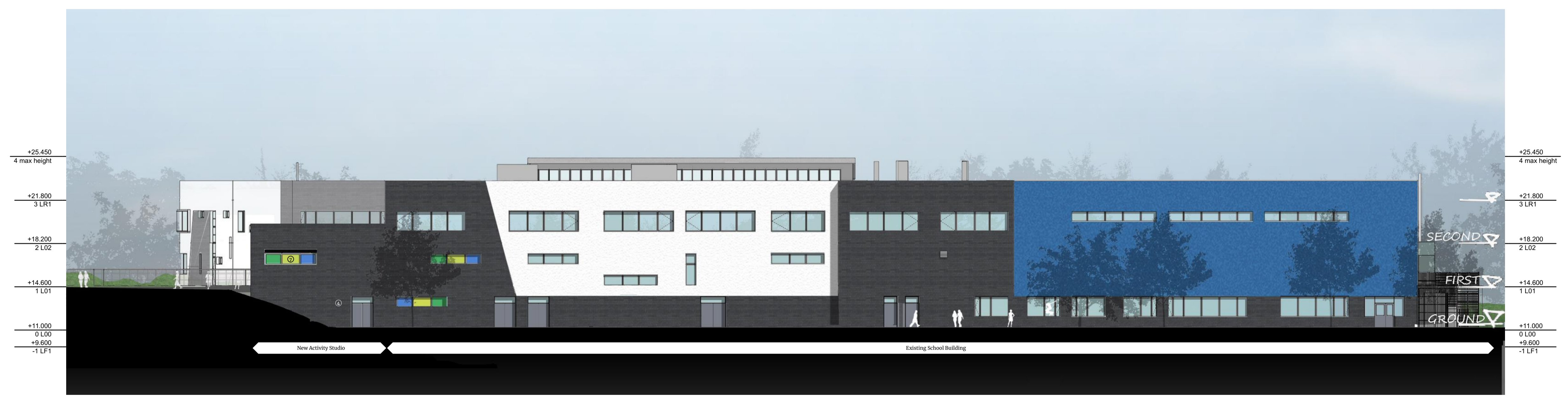
0000 PROPOSED NORTH ELEVATION