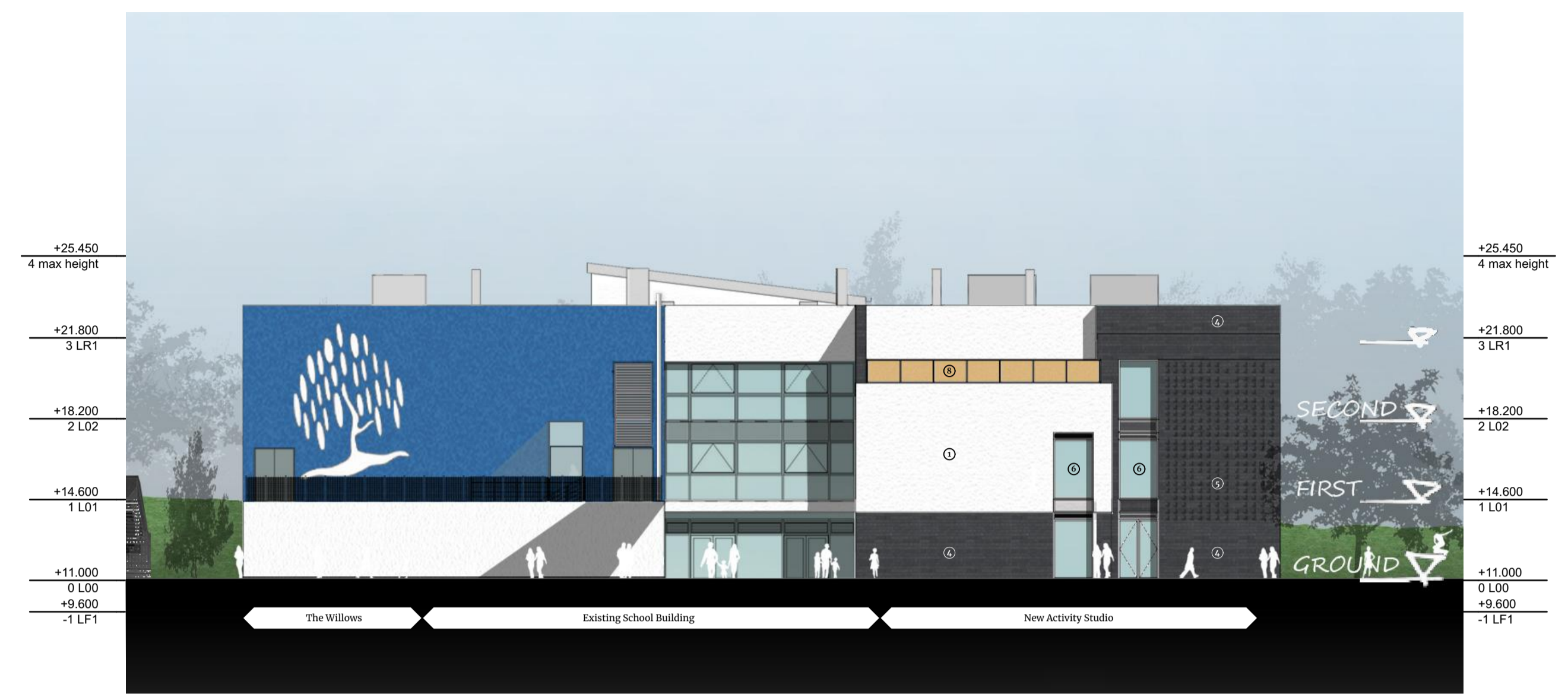
0000 PROPOSED WEST ELEVATION - GRAPHICAL