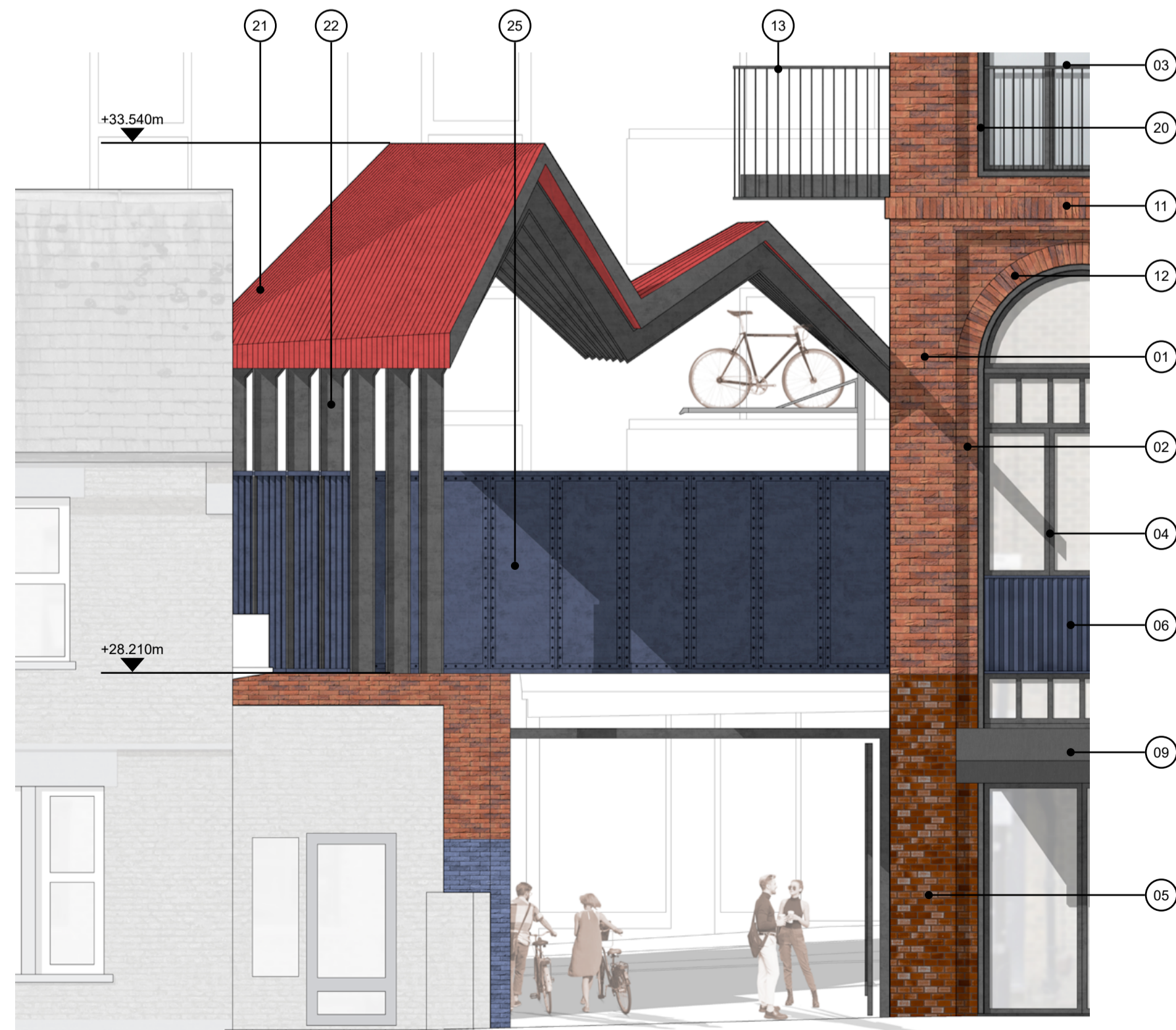
02 Yard South Elevation 1:50