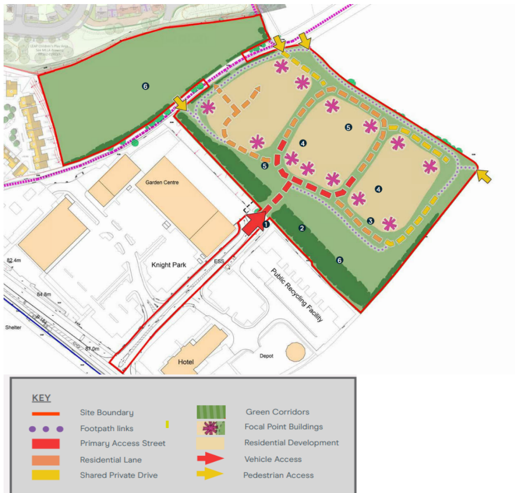
Figure 2: The Framework Masterplan contained with the Design Code under outline application S62A/2023/0031

14.3.16 In light of the above plans, the proposed development ought to be constructed in accordance with these plans. The Design Code reflected three Character Areas that are broadly consistent with the host submitted Design Code.