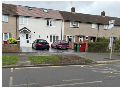
12 December 2025