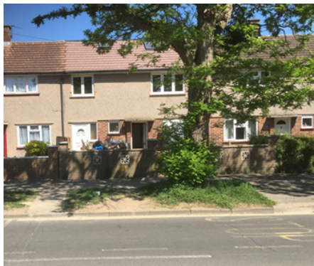
09 May 2025