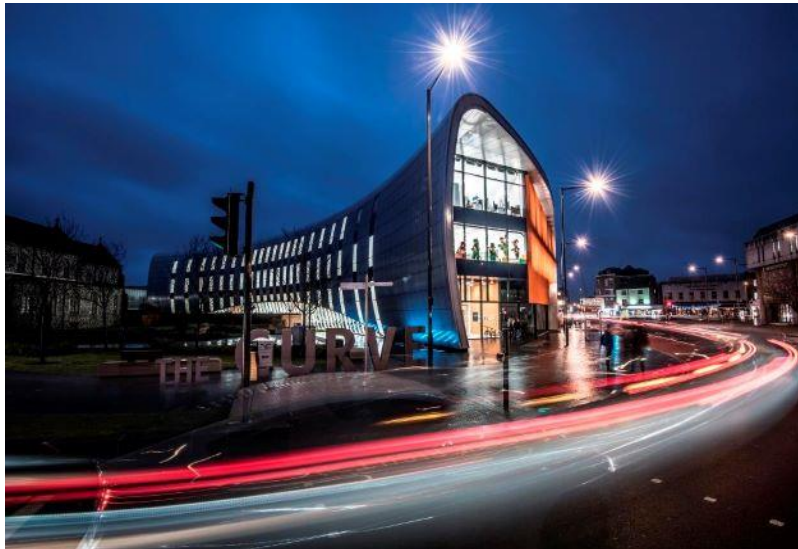
The Curve Slough's iconic library and cultural centre

Educational attainment in Slough is good, but the borough has pockets of deprivation and demands on children's and adults social services are growing in scale and complexity. Some families remain under pressure and the area has high rates of preventable ill health amongst both children and adults. Compared to local authorities in Berkshire and the average for England, Slough has the highest proportion of residents claiming Universal Credit and Housing Benefits. Slough remains the most relatively deprived area within Berkshire, followed by Reading. We are determined to develop services that are customer-oriented, focussed on early intervention, prevention, and evidence-based decision making.