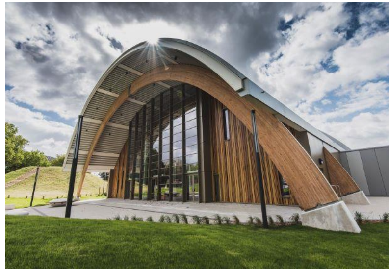
The Slough Ice Arena As well as the ice, there's also a well-equipped gym, alongside a climbing wall, dedicated Clip 'n' Climb wall and a café.