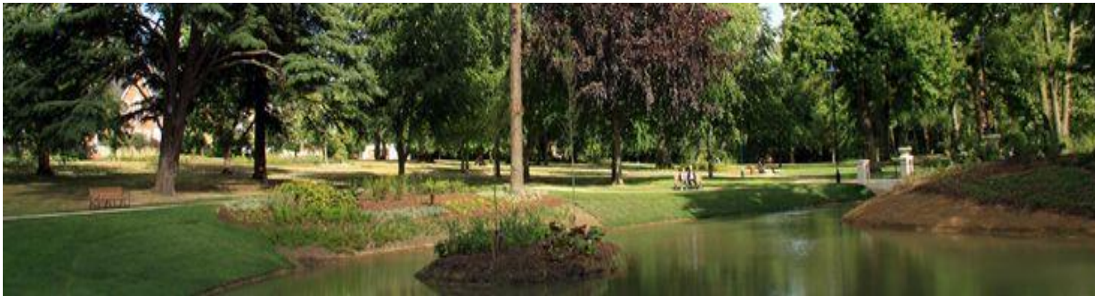
Herschel Park or Upton Park as it was originally called is Slough's oldest park

The council should regularly report progress on performance indicators (KPIs) against its Corporate Plan targets to Cabinet. Unfortunately, during 2022/23 this did not happen.