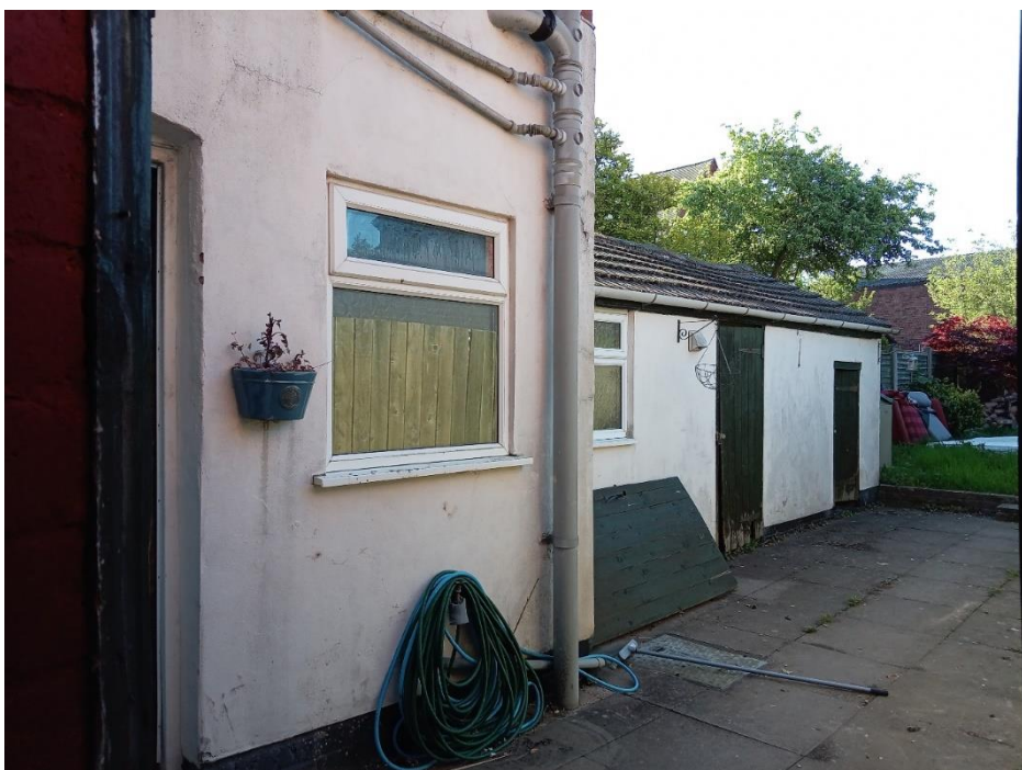
Fig 1 – Site Visit Photograph - Existing kitchen and outbuilding side elevation

A site visit was undertaken by the Planning Officer on 29 April 2026 (Figs 1, 2 & 3). No external works have commenced regarding the single storey rear extension.