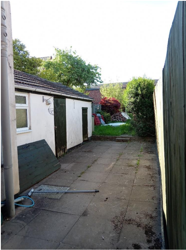
Fig 3 – Site Visit Photograph - Existing rear elevation