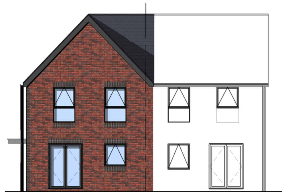
Side / Rear Elevation