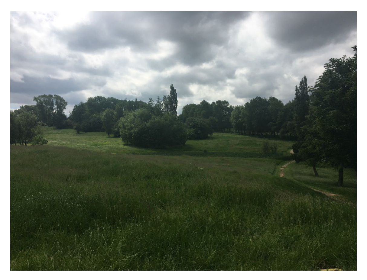
Plate 11 View of the Site from the eastern side looking west, showing the grass with rows of trees and footpaths.