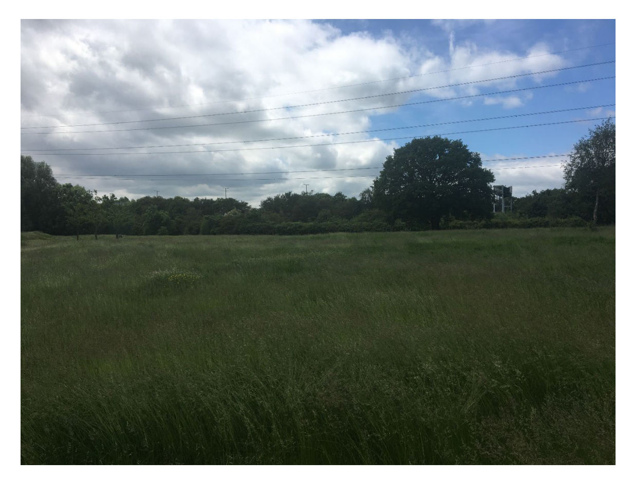
Plate 12 View to the south-west from the south-west corner of the Site shows the motorway beyond the Site.