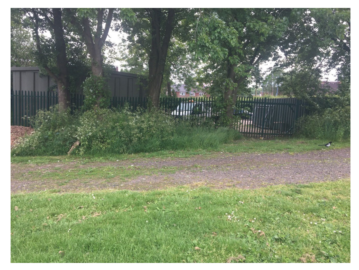
Plate 16 Modern compound at the southern end of the Site, around the site of Chapel Croft.