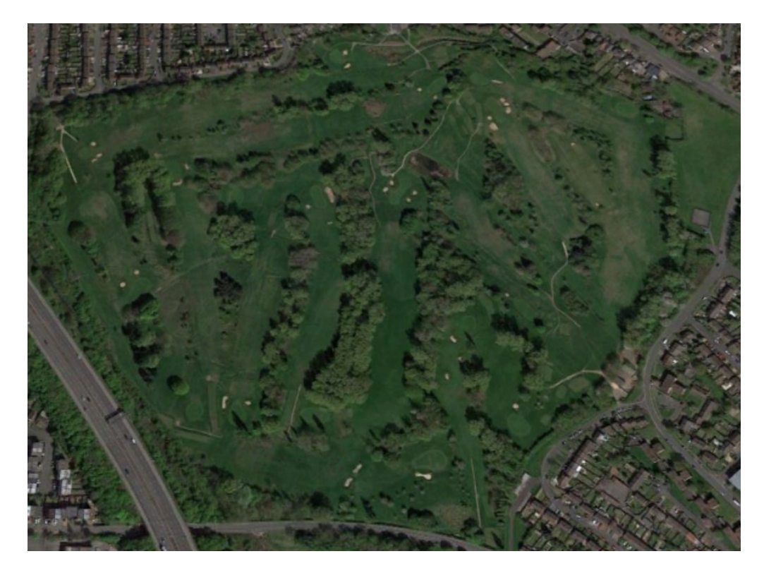
Plate 8 2020 aerial photograph showing the Site (2020, Google Earth Pro, Landsat / Copernicus).