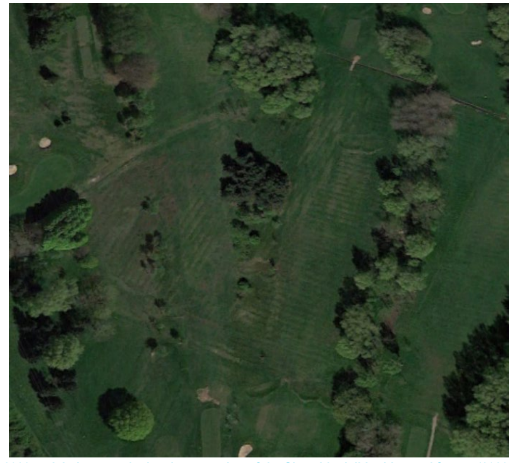
Plate 9 2020 aerial photograph showing a section of the Site with visible ridge and furrow (2020, Google Earth Pro, Landsat / Copernicus).