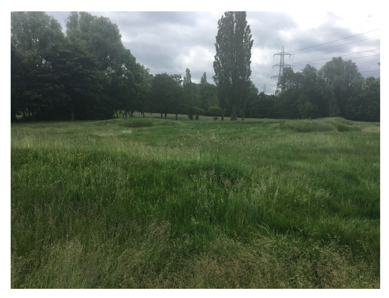
Plate 13 Bank features at the south-west end of the Site related to the golf course.