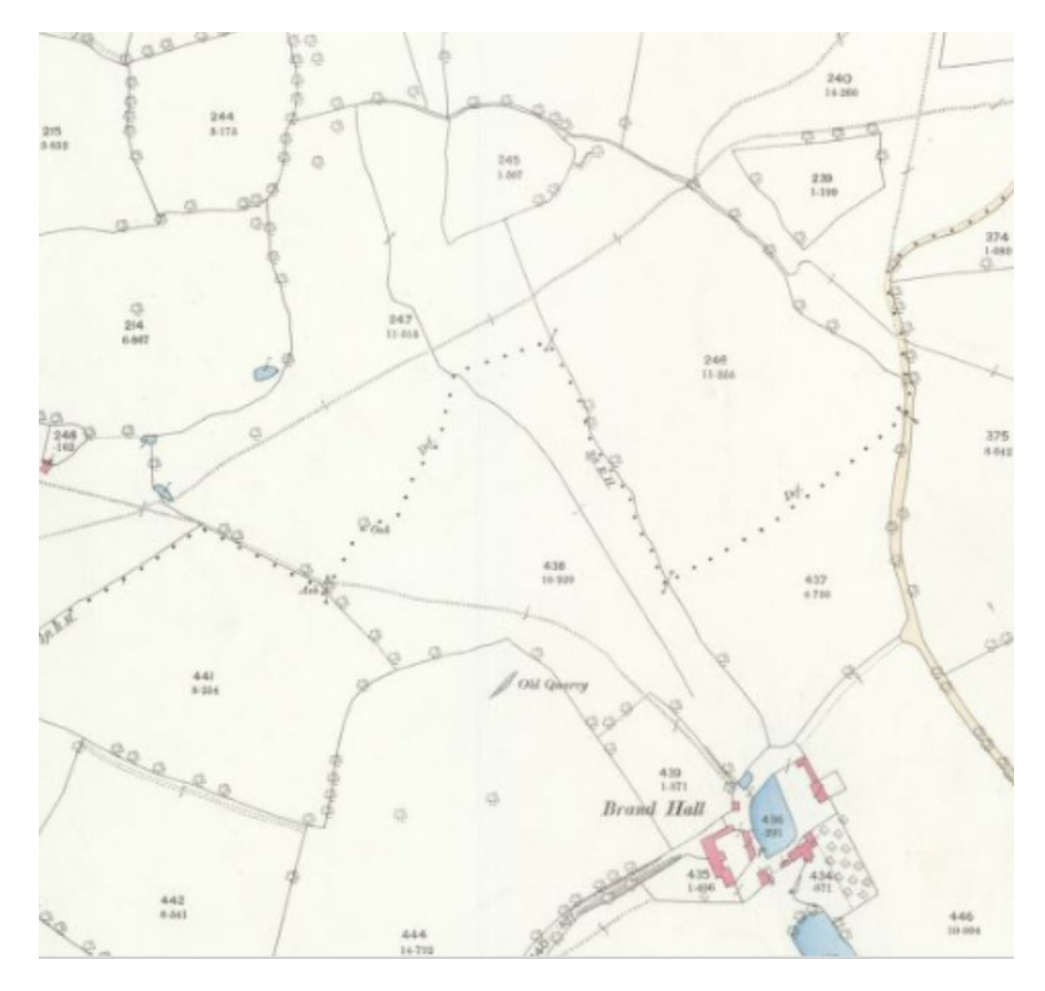
Plate 2 1885 OS map Worcestershire V.6 (Oldbury; Smethwick; Warley Woods)