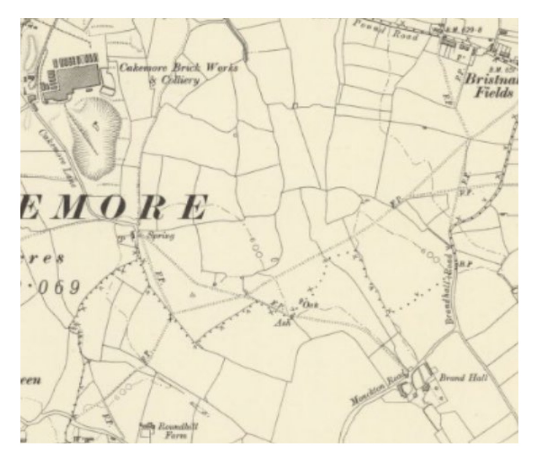
Plate 3 1904 OS Staffordshire LXXII.NW (includes: Hill and Cakemore; Oldbury)