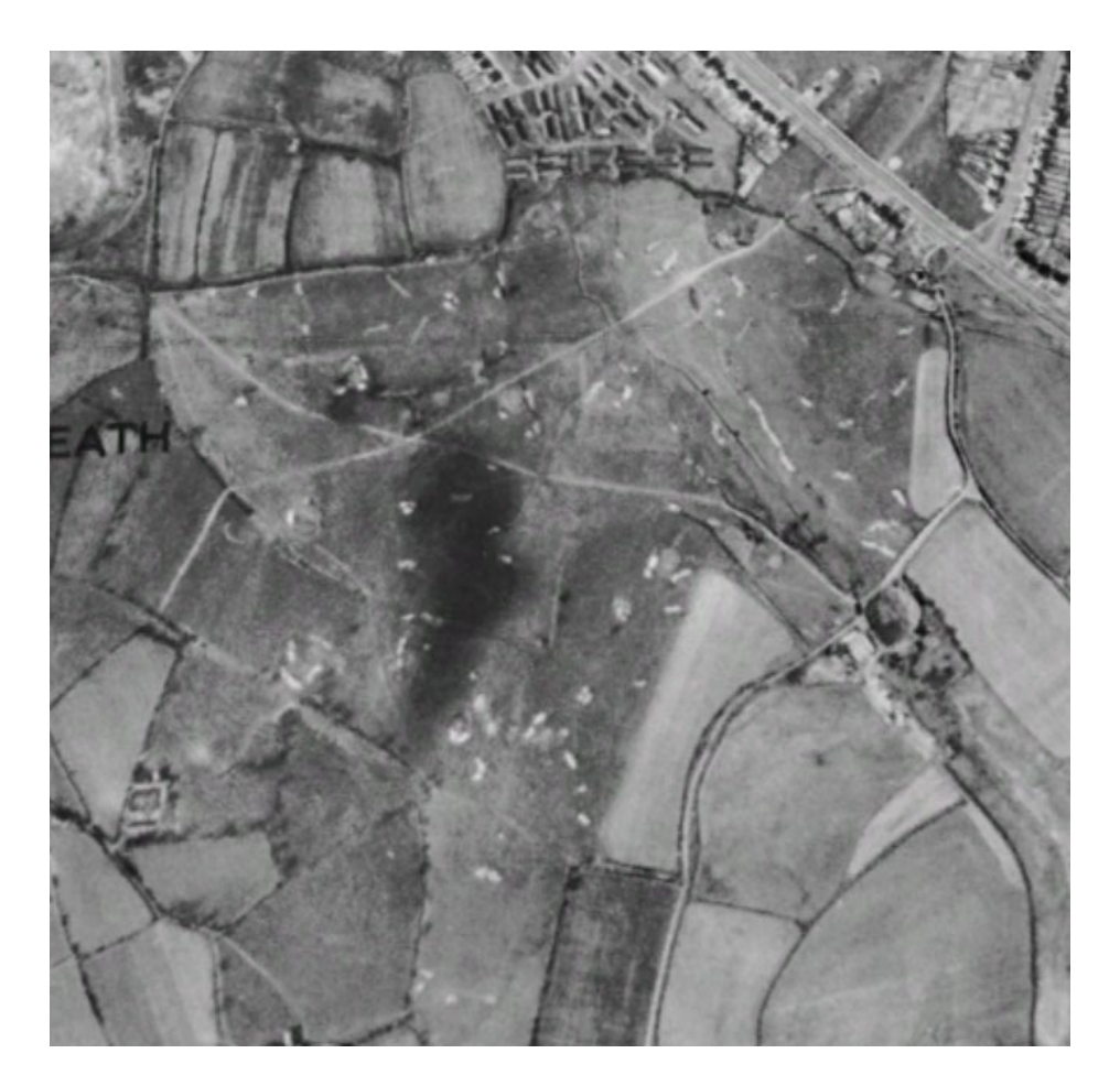
Plate 7 1945 aerial photograph of the Site showing the golf course as well as Brand Hall to the south-east of the Site (Google Earth Pro, Copyright 2021 The GeoInformation Group).