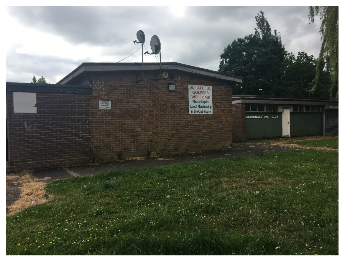
Plate 18 Golf clubhouse to the north of the Site.