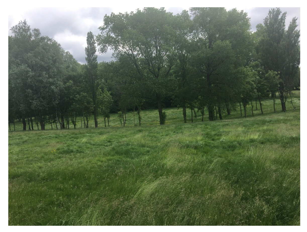
Plate 15 Area of ridge and furrow visible on aerial photography within the Site was indistinct from the ground due to the long grass.