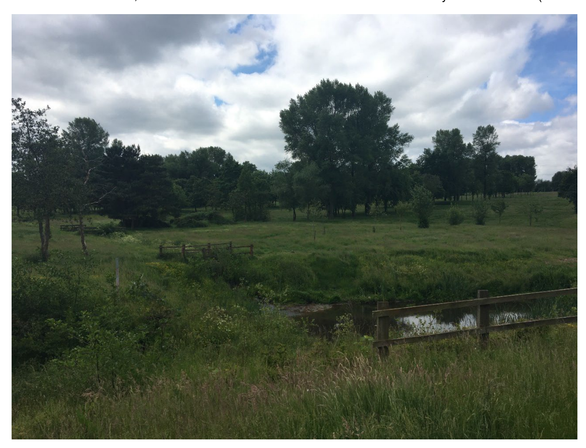
Plate 10 View south from the northern edge of the Site, showing the stream and wooden bridges.