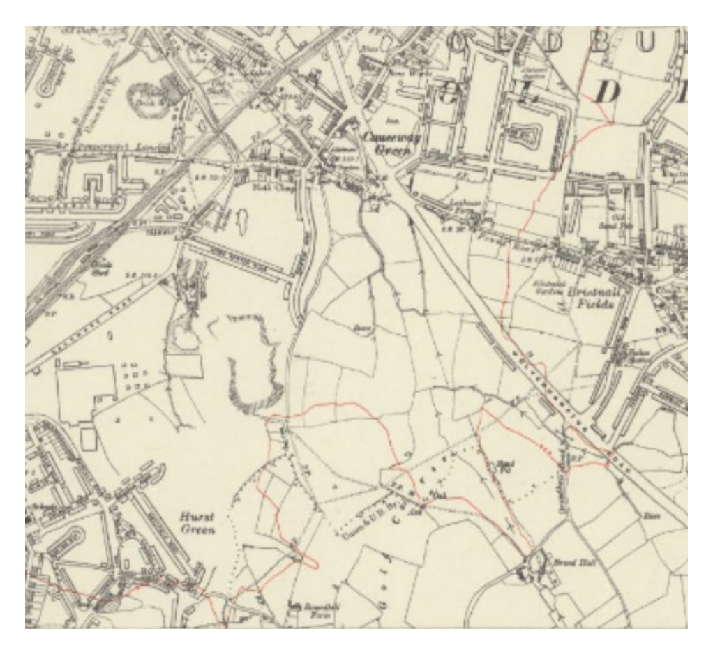
Plate 5 1944 OS map, Staffordshire LXXII.NW (includes: Hill and Cakemore; Oldbury)