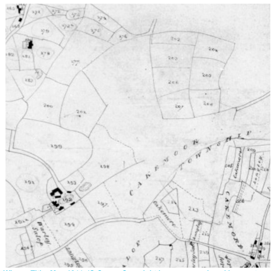
Plate 1 Warley Wigorn Tithe Map 1844.