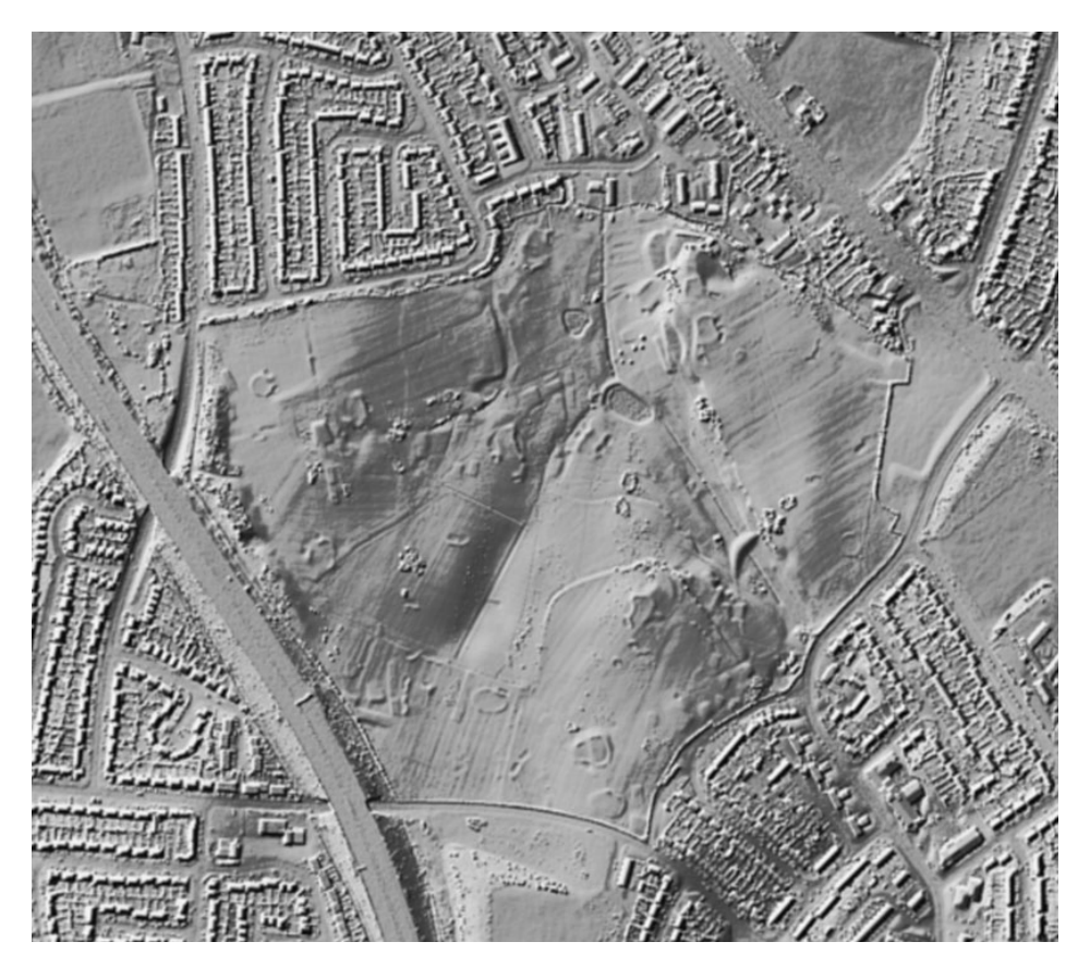
Plate 6 1m DSM LiDAR imaging of the Site reveals various feature, most coinciding with golf course features. (House Prices, LiDAR imaging. https://houseprices.io/lab/lidar/map?ref=TQ64934%2090278)