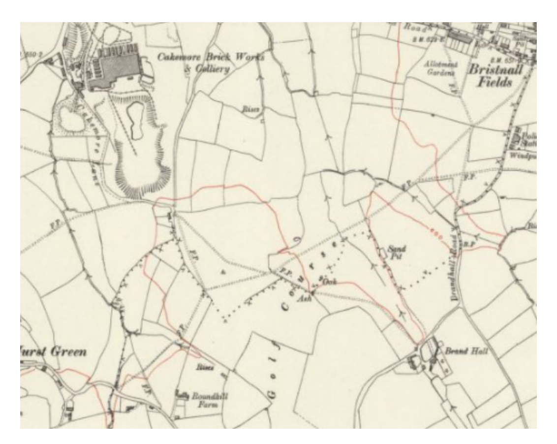
Plate 4 1921 OS map Staffordshire LXXII (includes: Birmingham; Oldbury; Smethwick)