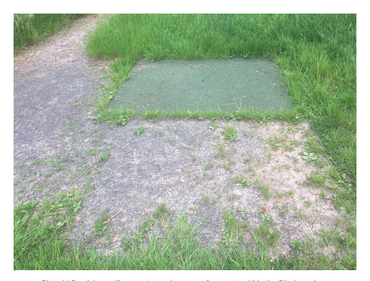
Plate 14 Surviving golf course tee and an area of concrete within the Site boundary.