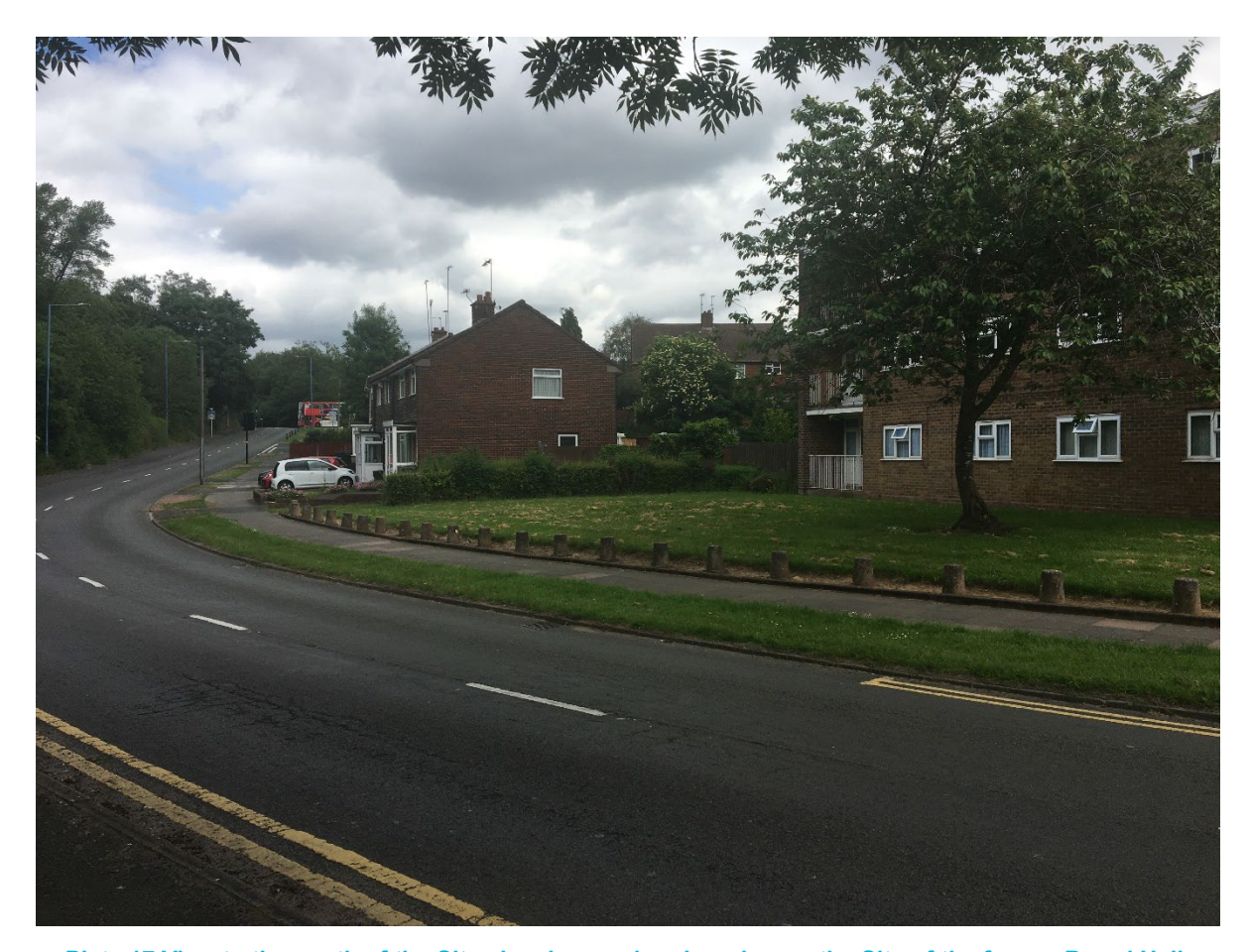
Plate 17 View to the south of the Site showing modern housing on the Site of the former Brand Hall.