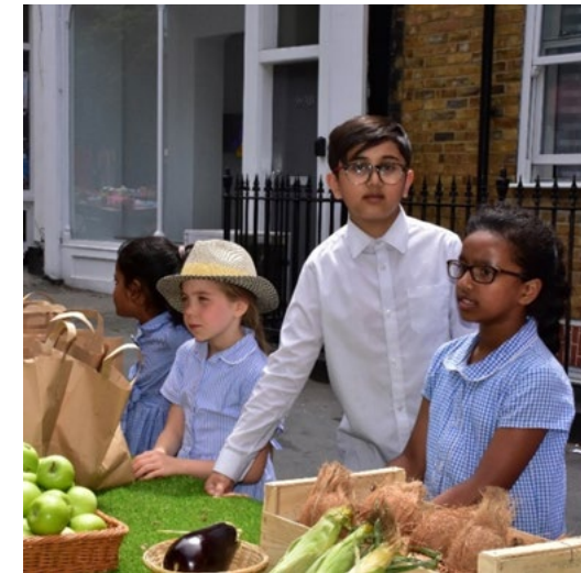
School "takeover" of Chilton Street Market, 2019