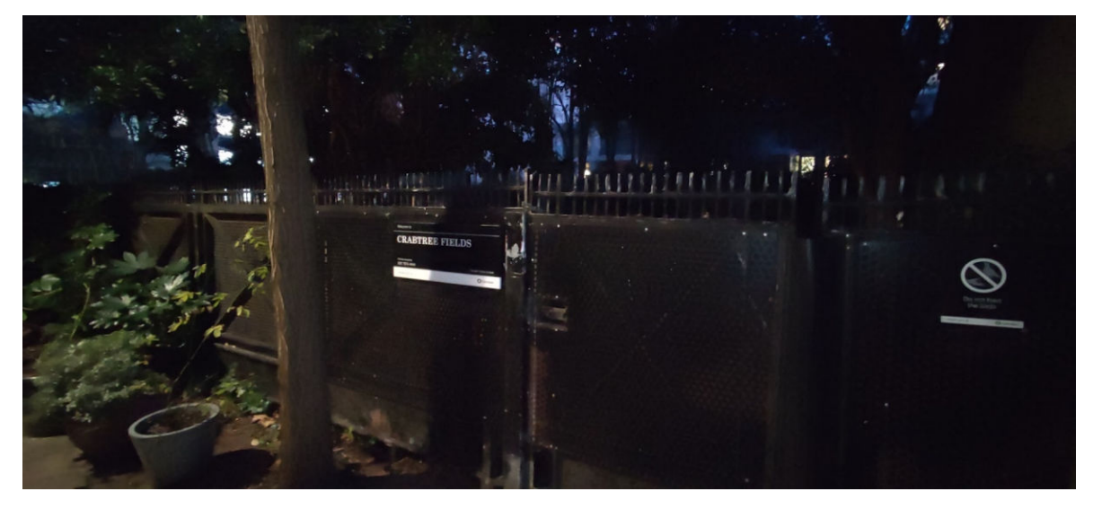
Figure 6: Crabtree Fields entrance on Colville Place