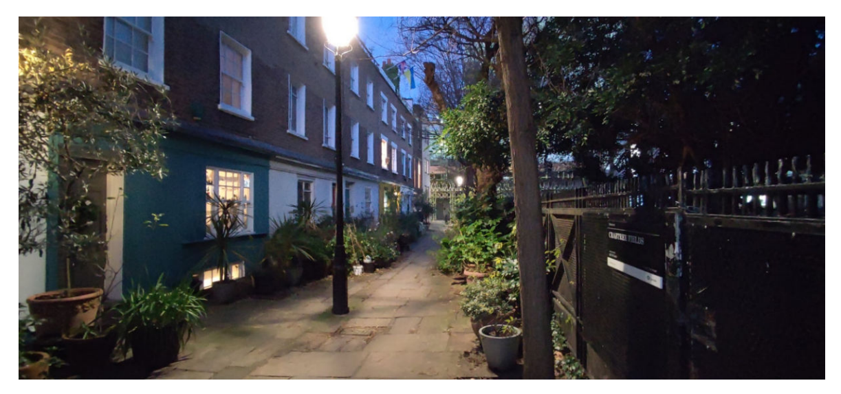
Figure 5: View along Colville Place towards Whitfield Street