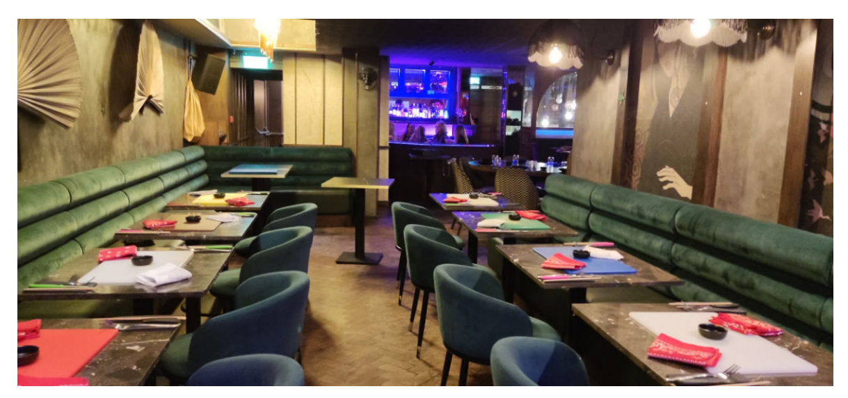
Figure 2: Ground floor dining area