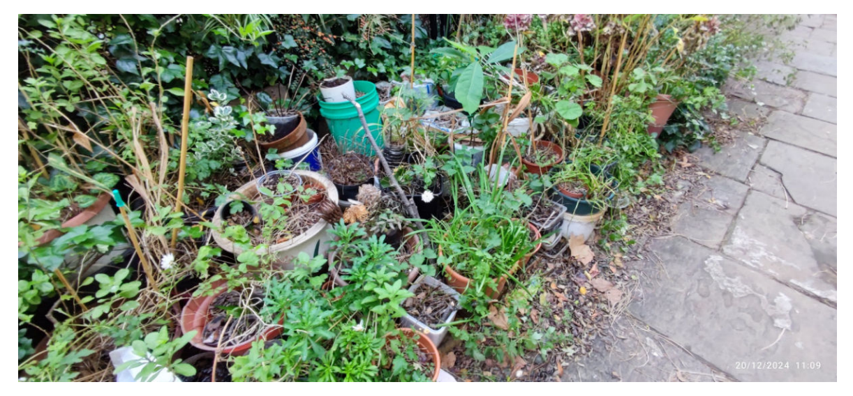
Figure 11: There is informal planting along Colville Place and rats were observed amongst the pots