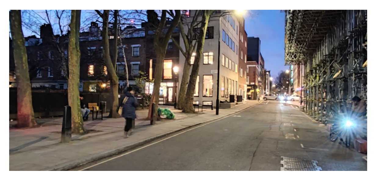
Figure 7: Crabtree Fields to the left. View towards Goodge Street from Whitfield Street