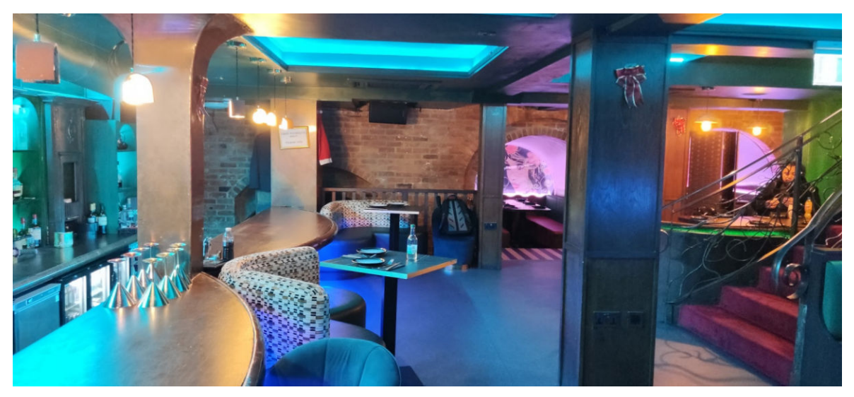
Figure 3: Basement with bar to the left and further dining tables