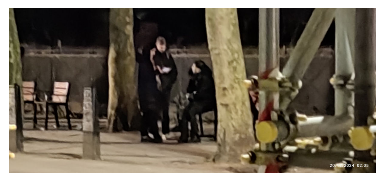
Figure 9: People congregating on seats after 02:00hrs on the night of my survey