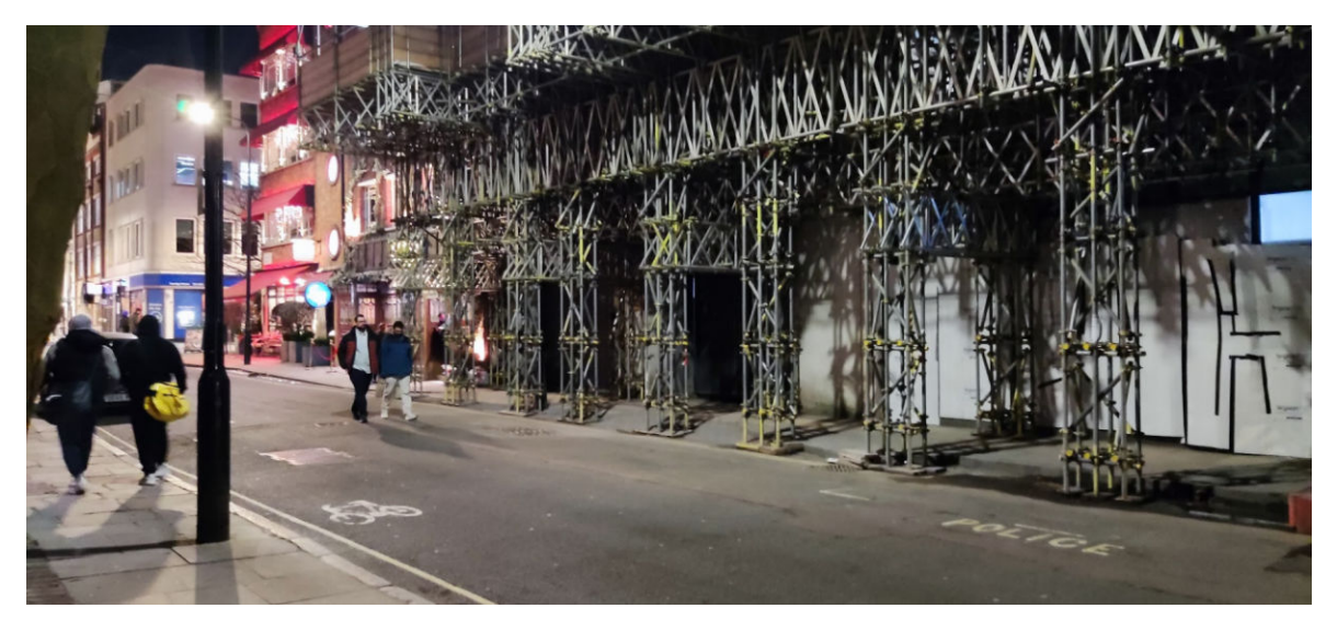
Figure 8: View of Whitfield Street from seats in front of Crabtree Fields