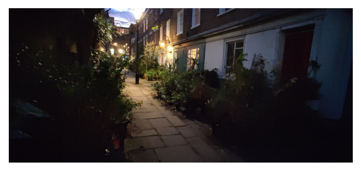
Figure 12: The planting creates shadows and hidden areas along Colville Place. This is unusual in Camden where a positive approach to designing out crime has led to improved public spaces to create a safer environment and to reduce ASB so that members of the public feel safer at night