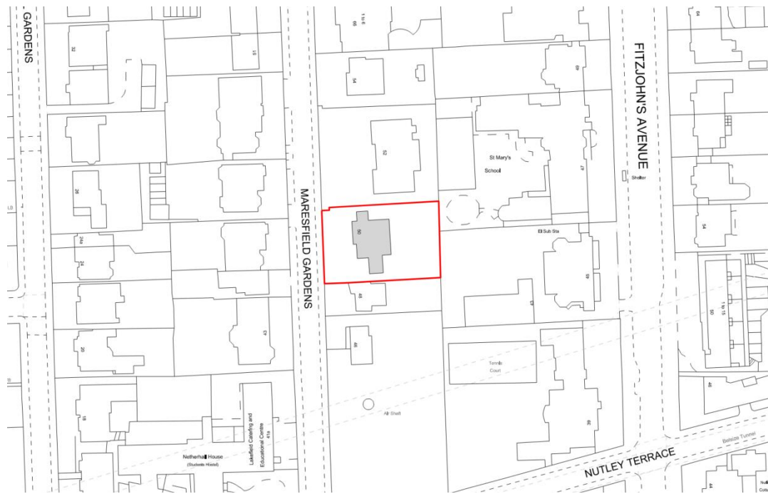
Figure 1 – The existing site