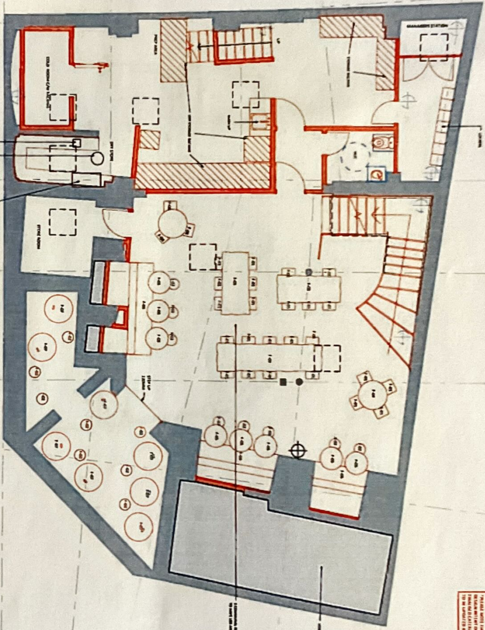
1 Proposed Basement Floor - General Arrangement