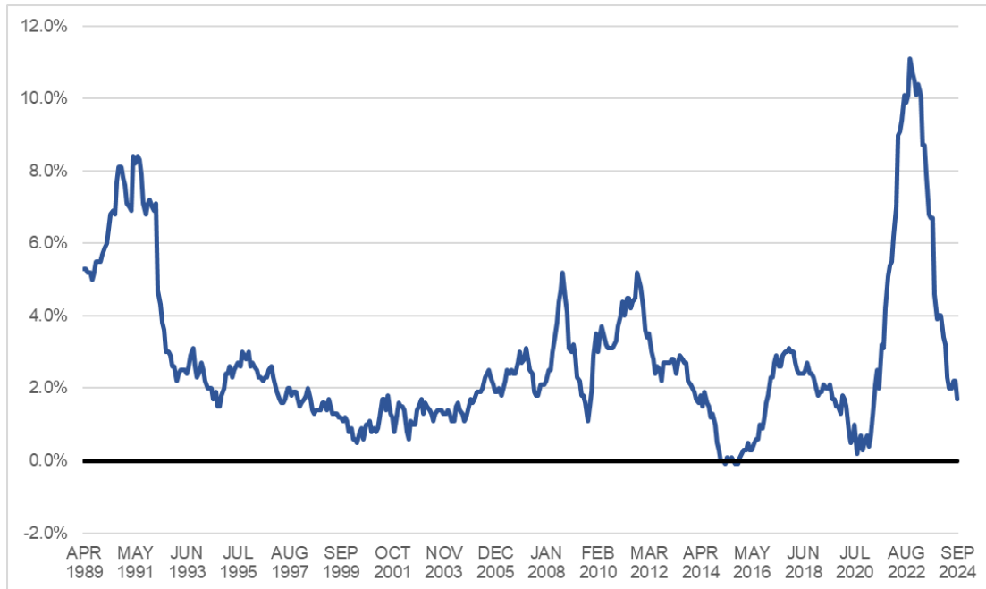
Chart One: CPI inflation rate over time

2.11. The timing and impact of inflation are not felt equally and varies significantly across our communities, exacerbating existing structural inequalities highlighted by the pandemic. Over the three years from May 2021 to May 2024, UK consumer prices increased by 20.8%, while food prices rose by 30.6%, resulting in a significant increase in the demand for food banks. 4 We are also experiencing increased demand for many Council services, such as temporary accommodation and the use of the Council's Cost of Living Crisis Fund.